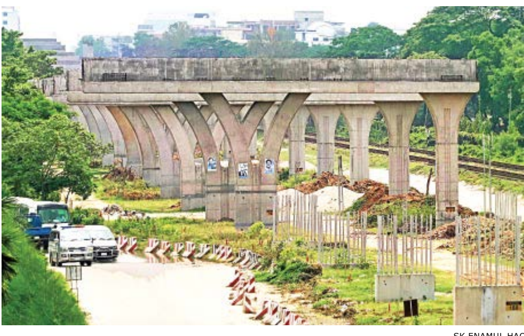
SK ENAMUL HAQ

Aktar said they have completed acquisition of necessary land and handed it over to the partners before the countrywide lockdown began due to the coronavirus pandemic.