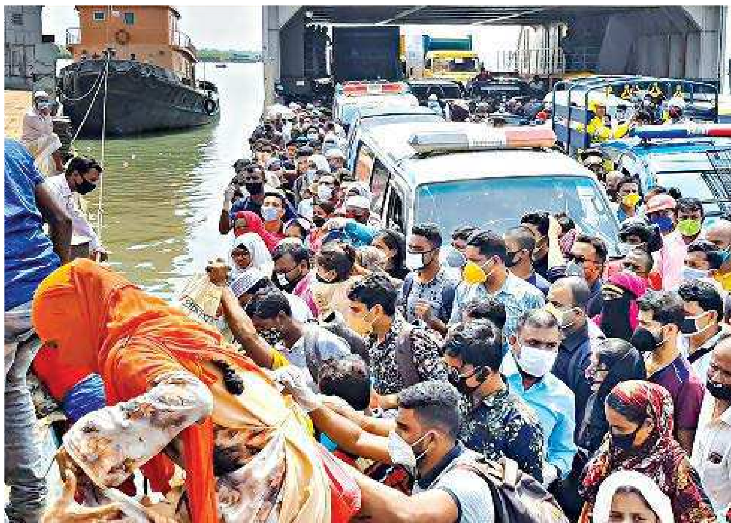
Hundreds of Dhaka-bound passengers, many of them garment workers, crowd to get off a ferry at Shimulia ferry terminal in Munshiganj yesterday disregarding social distancing guidelines.