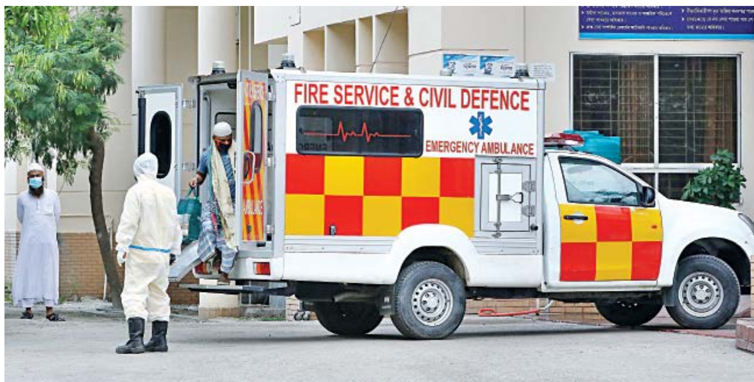
Anticlockwise from top, a patient who tested positive for coronavirus at Dhaka Medical College Hospital is brought in by a fire service ambulance to Mugda General Hospital yesterday, but due to a lack of beds, he had to wait for two and a half hours outside the facility before deciding to go back home in Fatullah of Narayanganj.