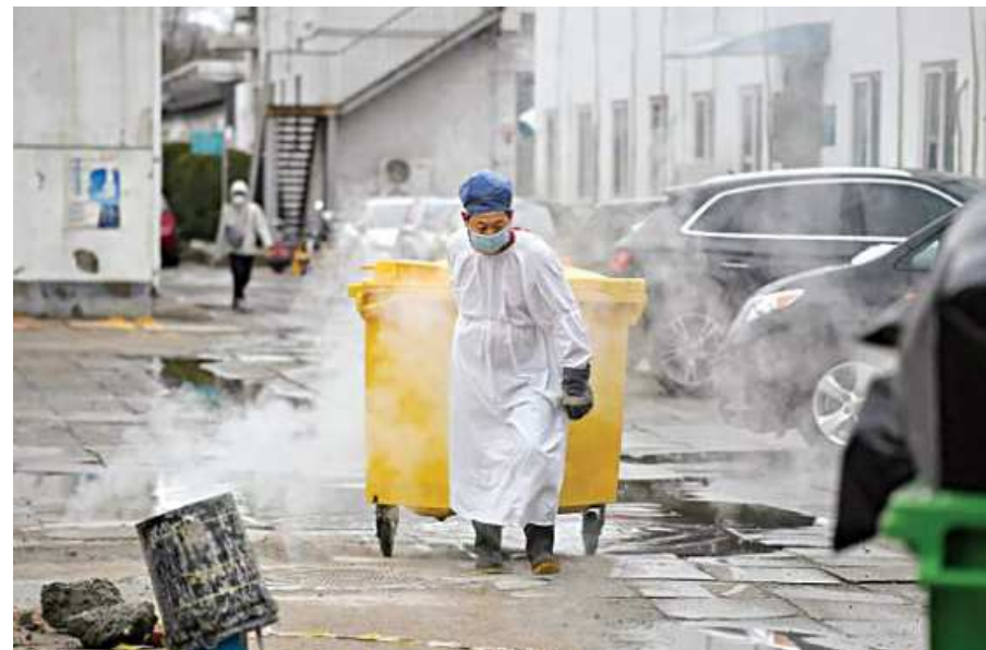
A worker moves medical waste at a hospital in Beijing treating coronavirus patients.