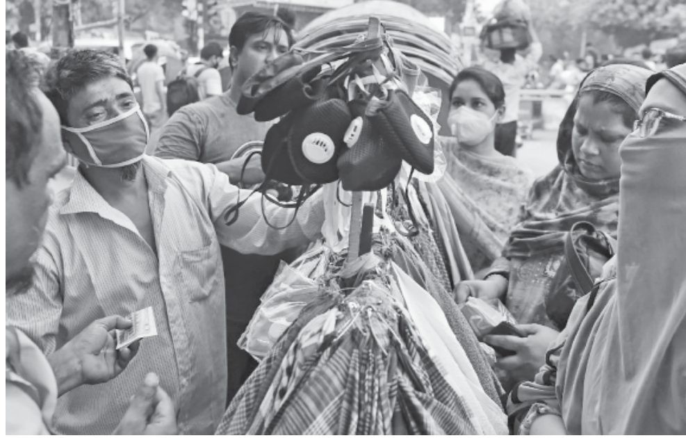
Bangladesh's infections figure appears negligible considering the population size in comparison with other affected comparable countries.

Potential spread multiplier (number of household members who could be infected if