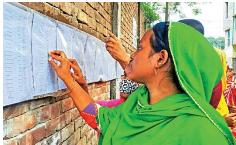
A worker at a garment factory in Ashulia checks whether her name is on the list of employees terminated by the management. The photo was taken yesterday.