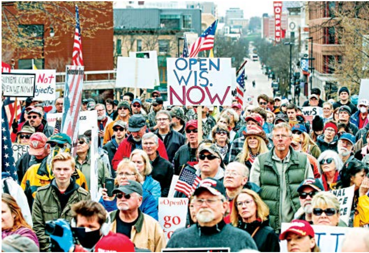
People hold signs during a protest against the coronavirus shutdown in front of State Capitol in Madison, Wisconsin, on Friday. Gyms, hair salons and tattoo parlors had a green light to reopen in the US state of Georgia on Friday as the death toll from the coronavirus pandemic soared past 50,000 in the US.

Chinese model KN95 masks are similar to N95 masks, as well as the FFP2 model used in Europe.