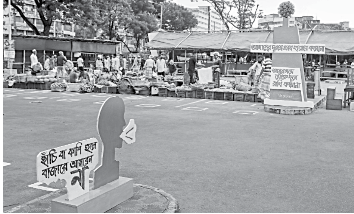
Riajuddin Bazar kitchen market's new home at the nearby Railway Station parking lot. Not only shops are spaced out to ensure social distancing, law enforcers have also put up signs to generate awareness among shoppers. This photo was taken on Friday afternoon.