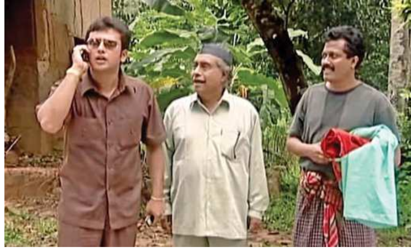
Montri Mohadoyer Agomon Shubheccha Shagotom