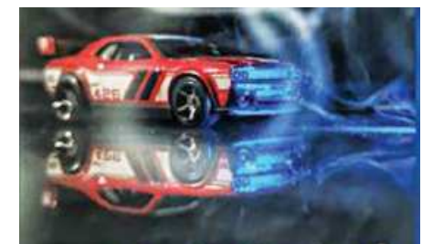
Prito Reza's product photography

Reza explained that as we stay indoors, we could try product photography. He showed some simple concepts for creating visually interesting photographs and encouraged the audience to spend their time at home creatively.