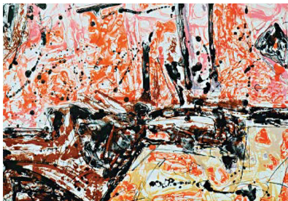
A painting by Alamgir Huque.