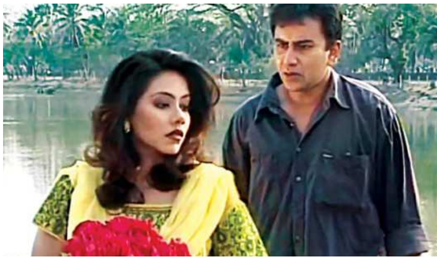
Neetu Tomake Bhalobashi

Lastly, Aaj Robibar , starring Aly Zaker, Asaduzzaman Noor, Zahid Hasan, Suborna Mustafa, and Meher Afroz Shaon among others, is a family series that is beloved across generations for its unique characters and unparalleled humour.