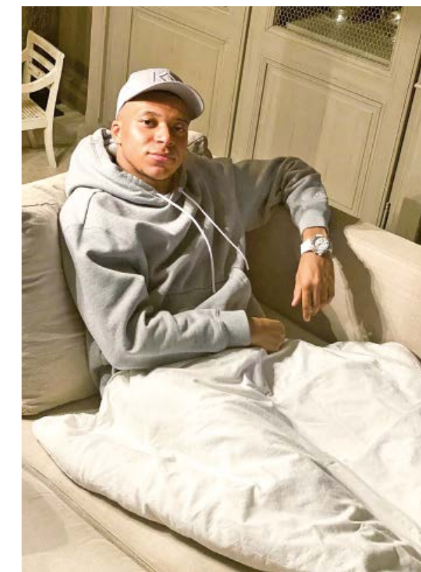
While Kylian Mbappe decided to go the route of curling up under a blanket and patiently waiting out the coronavirus pandemic, Neymar channelled the other half of the population as he decided to pursue more productive interests.

But Ganguly said that had no bearing on India. "The social reality of Germany and India are different, there will be no cricket in India in the near future," Ganguly told Times of India. "There are too many ifs and buts involved. More importantly, I don't believe in sport when there is a risk to human life."