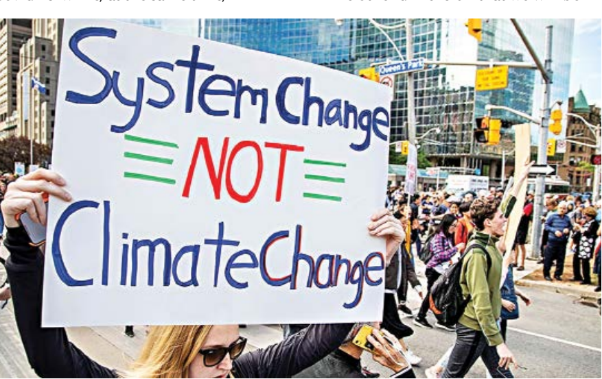
Climate change is only going to make health crises like coronavirus more frequent and worse.

gulations by the police. The other dimension that we will be