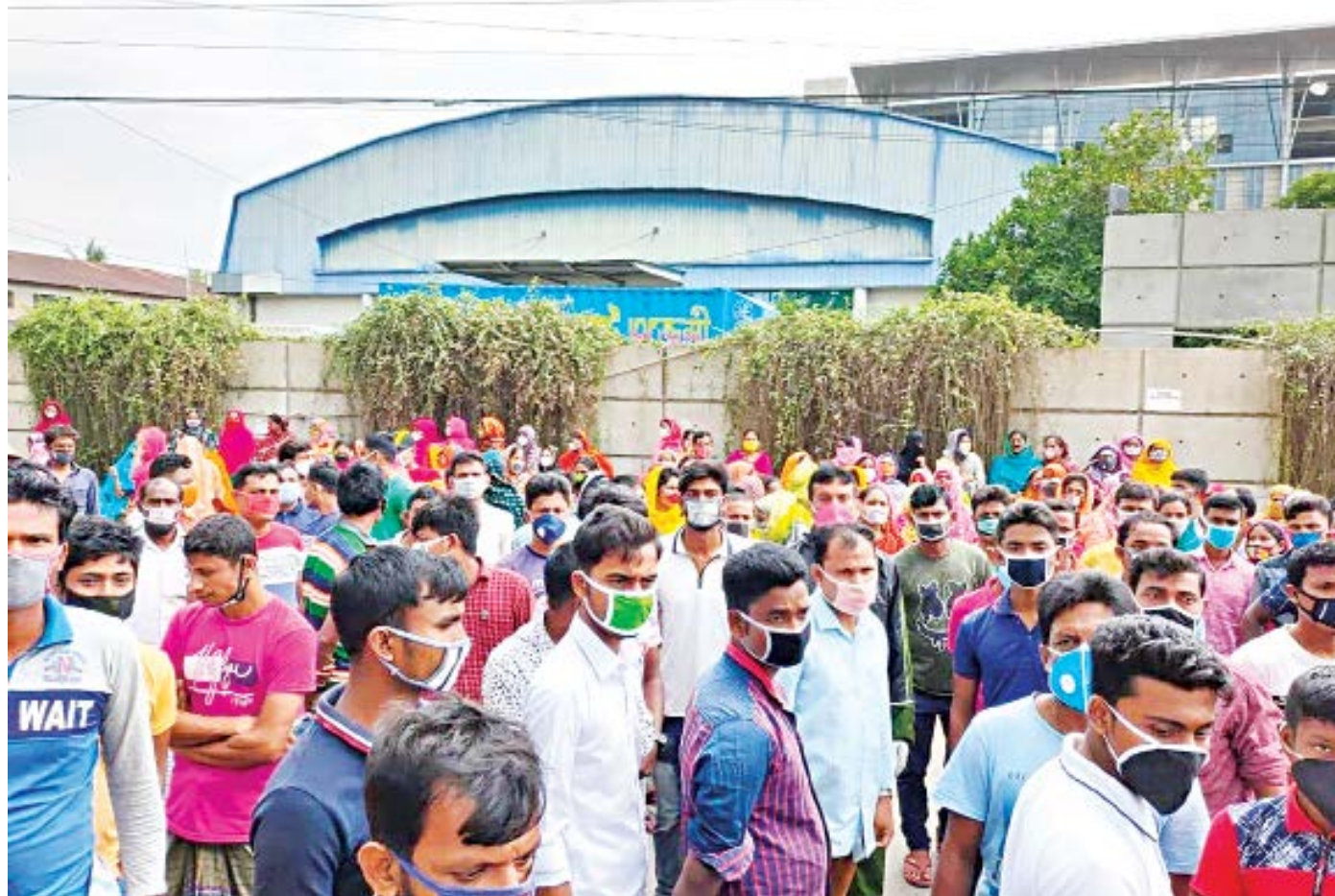
Garment workers wait for their salary in front of a factory in the Ashulia industrial belt on the outskirts of Dhaka. The photo was taken recently.

protocols and also expecting a clear guideline from government," it said on Tuesday.