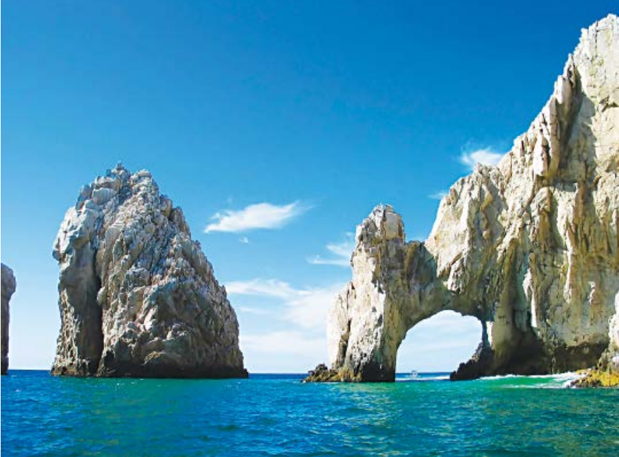
El Arco, Sea of Cortez, Mexico.

celled organisms—date to 3.85 billion years ago. Since then, life suffered wave after wave of cataclysmic extinctions. The dinosaurs are perhaps the most famous extinct creatures who roamed the Earth's surface unchallenged during the Mesozoic Era. After surviving for nearly 165 million years, they became victims of the greatest mass deaths in the history of our planet 65 million years ago when a large asteroid hit the Earth.