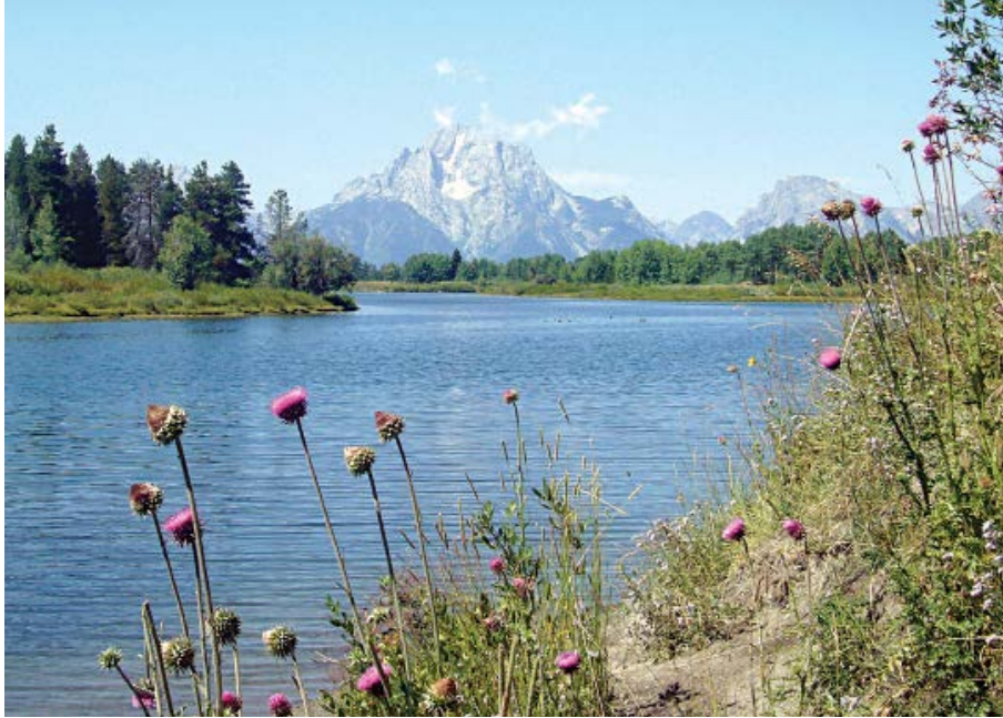
Teton Mountains, Wyoming, USA.

The second tenet sought to position humankind outside the realm of nature. Many people still continue to view human beings as separate from nature and persist in thinking we can do whatever we please without harming the planet. To the contrary, our independence is an illusion, engendered by our remoteness from a world we see through rose-coloured