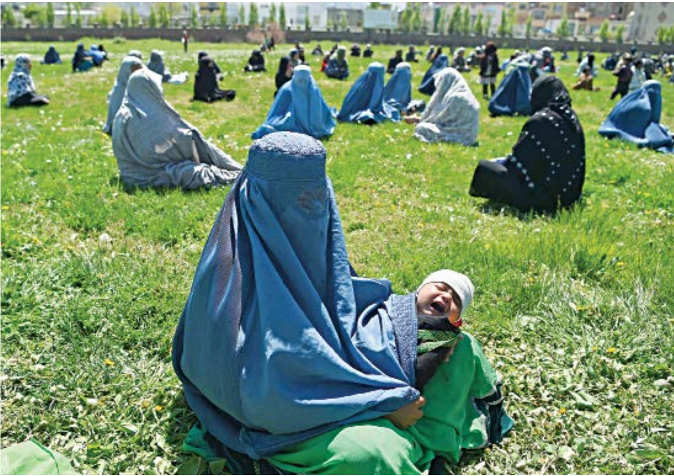
A woman wearing a burqa holds her child as she waits to receive free wheat from the government emergency committee during a government-imposed lockdown on the capital city as a preventive measure against the COVID-19 coronavirus, in Kabul, yesterday.

Previous absences from the public eye on Kim’s part have prompted speculation about his health. In 2014 he dropped out of sight for nearly six weeks before reappearing with a cane. Days later, the South’s spy agency said he had undergone surgery to remove a cyst from his ankle.