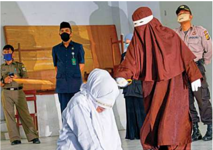
A woman (C) is whipped by the religious police in a public building in Banda Aceh yesterday, as punishment after he was caught in close proximity with a man who is not her husband in a hotel.