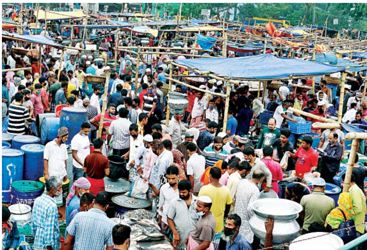
The fish market in Gazipur's Abdullahpur is an example of how to violate social distancing guidelines during the ongoing coronavirus outbreak. Along with Dhaka and Narayanganj, Gazipur is one of the worst-affected areas in the country, but despite police officials being present and loud speakers communicating the need to maintain distance, the buyers and sellers paid no heed yesterday.