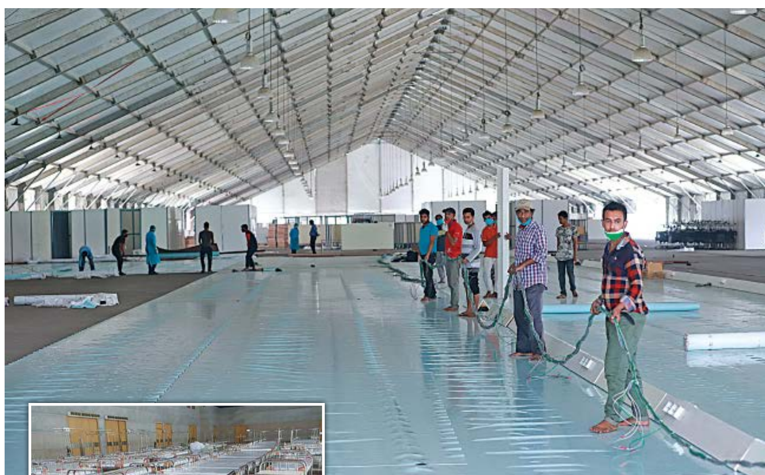
Workers setting up a 2,000-bed hospital at the International Convention City Bashundhara, which will be dedicated to treating Covid-19 patients. The hospital is expected to open by April 25. Inset, some beds for the hospital. This photo was taken yesterday.