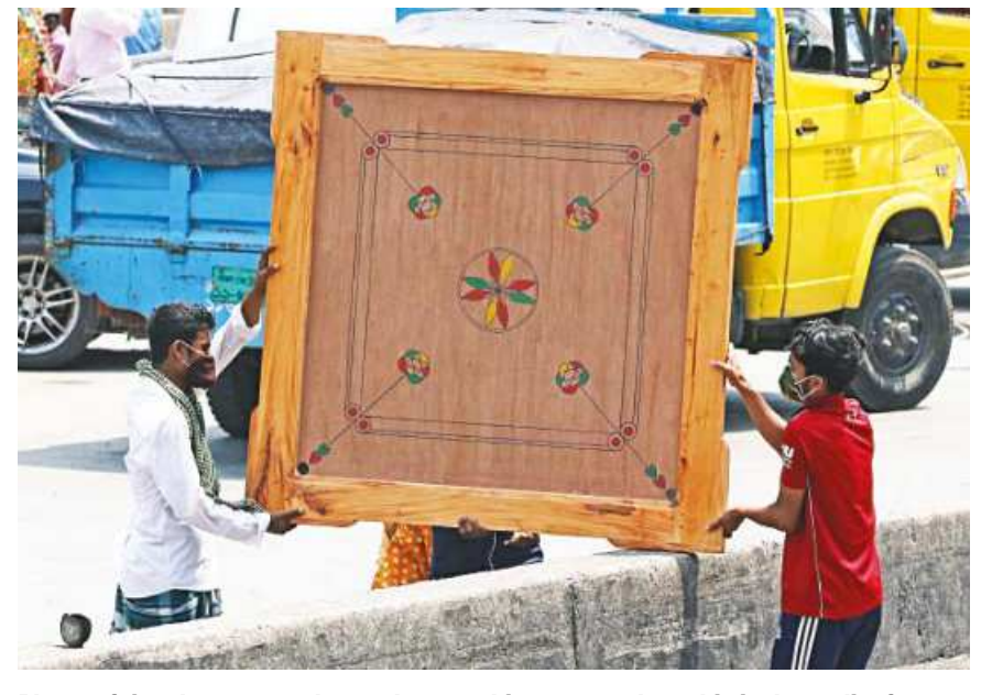
Plenty of time but not much or at least nothing new to do -- this is the reality for most sports fanatics around the globe who are now confined indoors due to the coronavirus pandemic. But sports enthusiasts find a way to stay connected with the game they love. Such avid sports lovers were seen in the Azampur area in Uttara carrying a board of carom, a very popular indoor game in the country, as the outdoor games have now been halted for more than a month.

Asked if City are sending through information and drills, he said: "They send us like a fairly big programme."