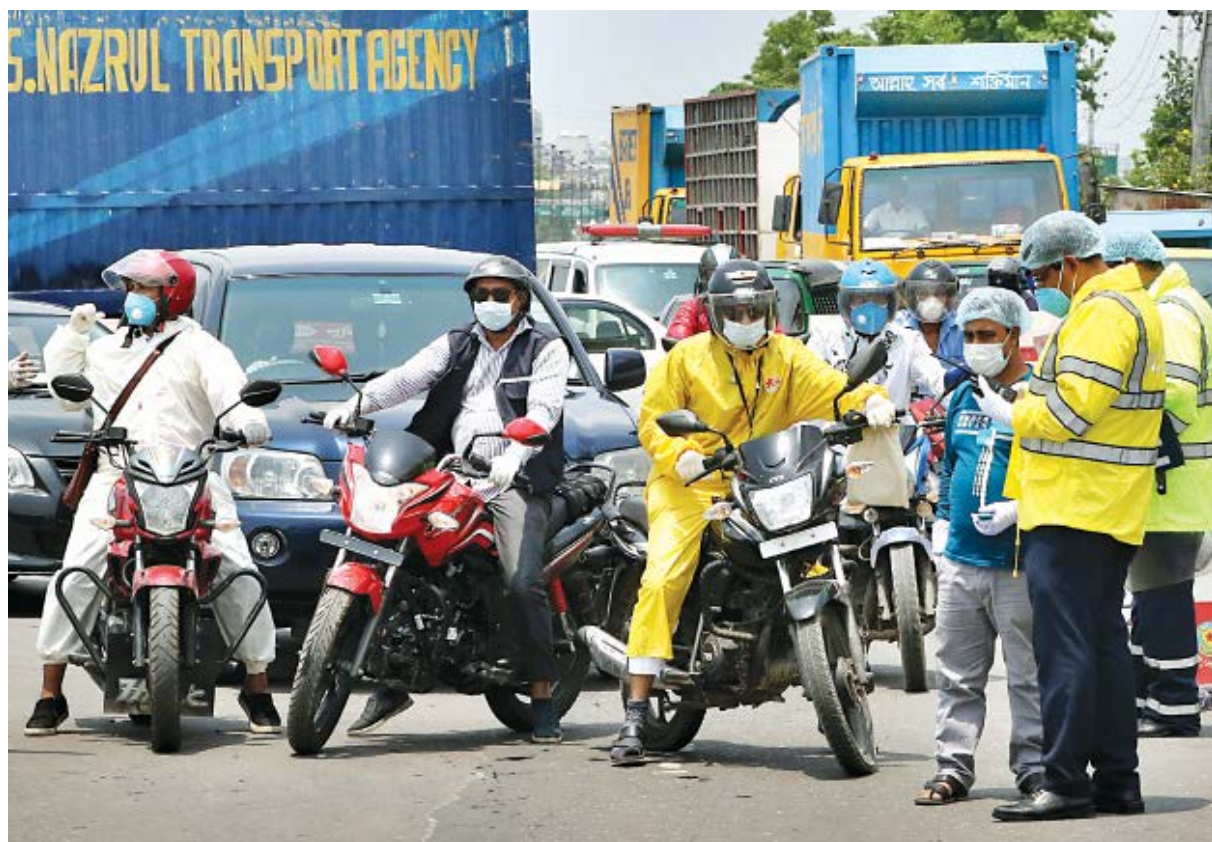
Police stop vehicles on Airport Road near the Balaka Bhaban yesterday and check to see if people entering deeper into the capital had legitimate reason to be out. The checkpoint caused unnecessary queues since the cops left an hour later withdrawing the checkpoint. The photo was taken around 11:30am.