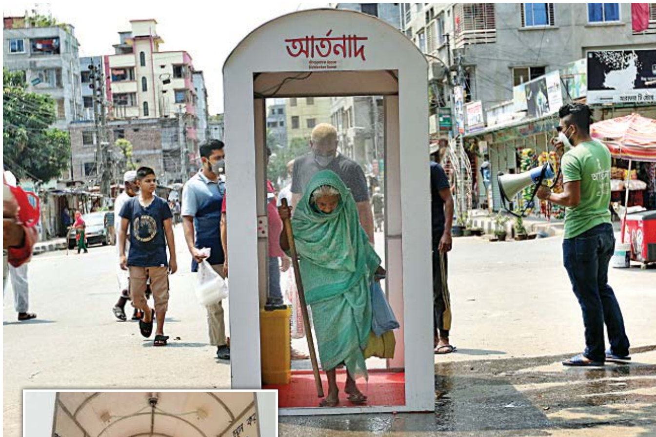
A woman goes through a spray arch on a street in Mirpur-6 in the capital yesterday. Local youth organisation Artana built the arch and set it up there so that everyone getting into their neighbourhood are disinfected first. Inset , Inside of the arch.