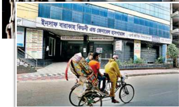
Insaf Barakah Kidney and General Hospital in the capital's Moghbazar area has been put under lockdown following a government directive, as 10 staffers there, including doctors, nurses and other workers, have tested positive for coronavirus.