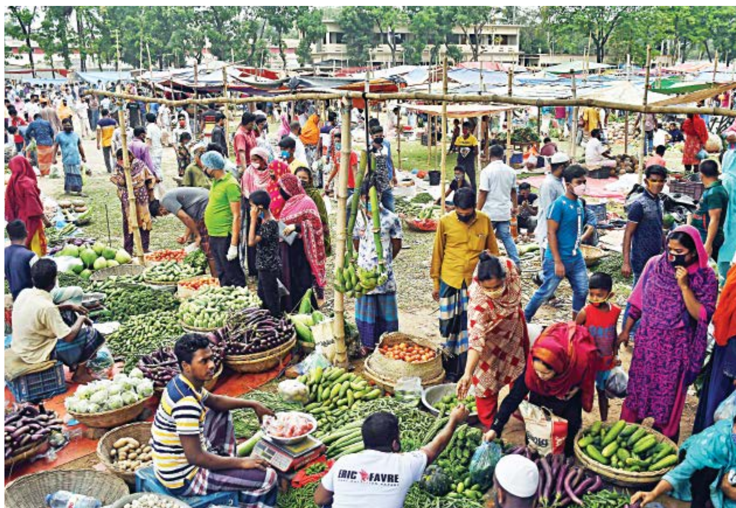
People still disregard physical distancing at a makeshift kitchen market on Ashulia School and College playground. Authorities shifted Ashulia's largest kitchen market to the playground two days ago to ensure distancing, but to no avail. The photo was taken yesterday.