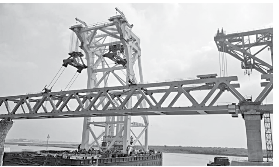
The newly-installed 28th span of the Padma Bridge. With this, more than four kilometres of the much-anticipated bridge has become visible.

increased for the first time since Sunday.