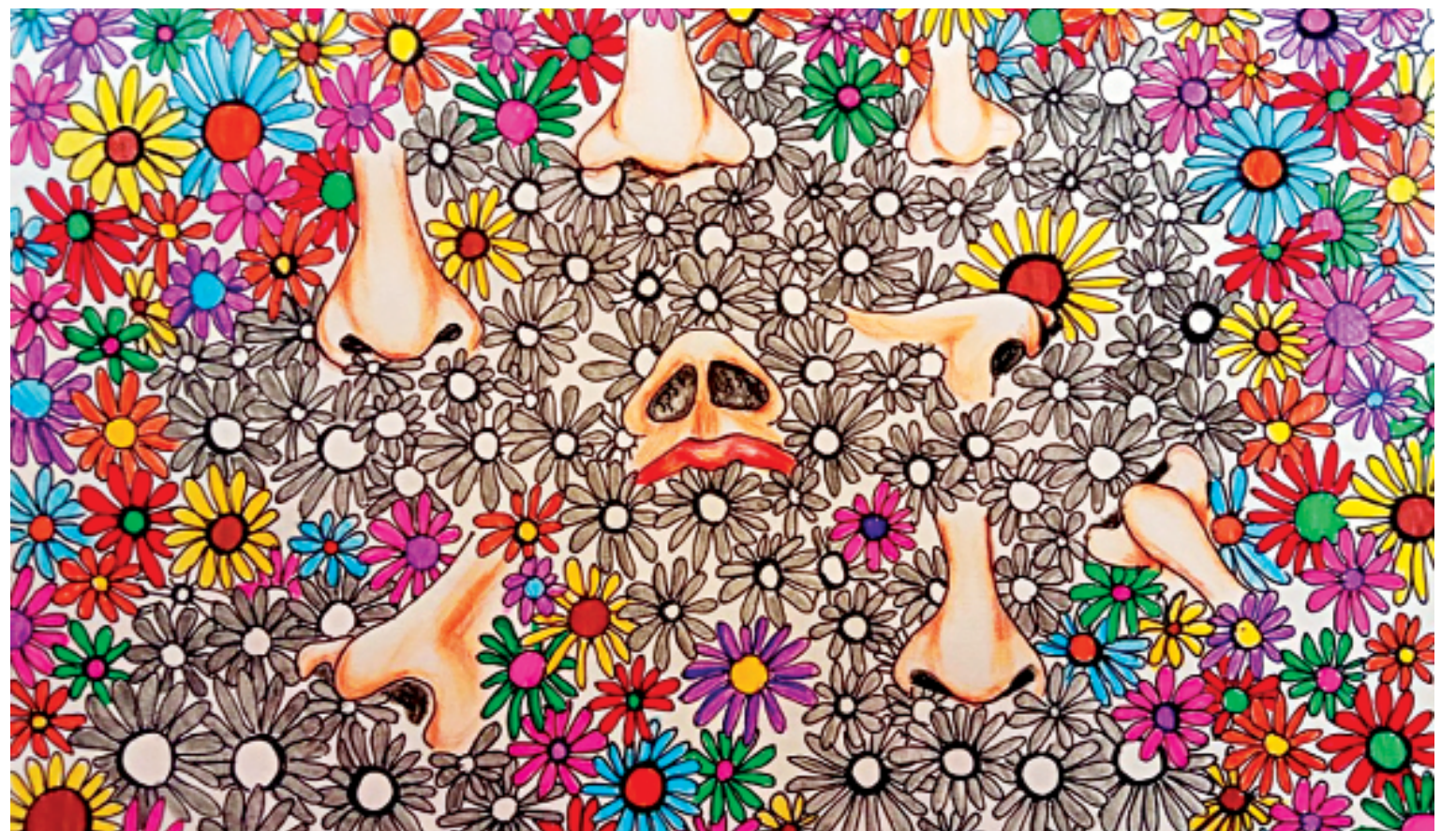
ILLUSTRATION: NANJIBA SHOILY

really mean it. Captured it and gave it a freedom as a token. Perhaps it was a beast and we poked it? And now it's woken. Still so fragile, so it must be broken. Tame it or rope it. Tie it up and dope it. Flood it with madness till its choking. Why is it still hoping? There's a Bloodfall at Ocean Drive, have you seen it? It's a sight to behold, come friends, I really mean it. But now it seems another floods about to burst. Pull up old blueprints, go on and dam it. Bloody blood, can you feel my thirst? There were folks starving elsewhere, maybe understand it. The Bloodfall is the beauty, the Bloodfall is mine. It makes the sound of a million screams, But look how it does shine! There's a Bloodfall at Ocean Drive, have you seen it?