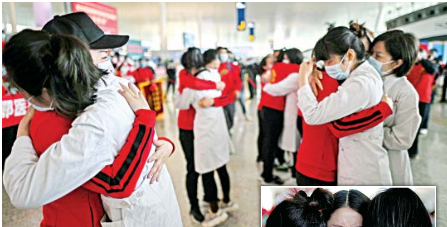
Departing medical staff from Jilin Province (in red) hug nurses from Wuhan after working together during the coronavirus outbreak at train station in China's central Hubei province, yesterday. Authorities yesterday lifted a more than two-month prohibition on outbound travel from the city where the global pandemic first emerged.