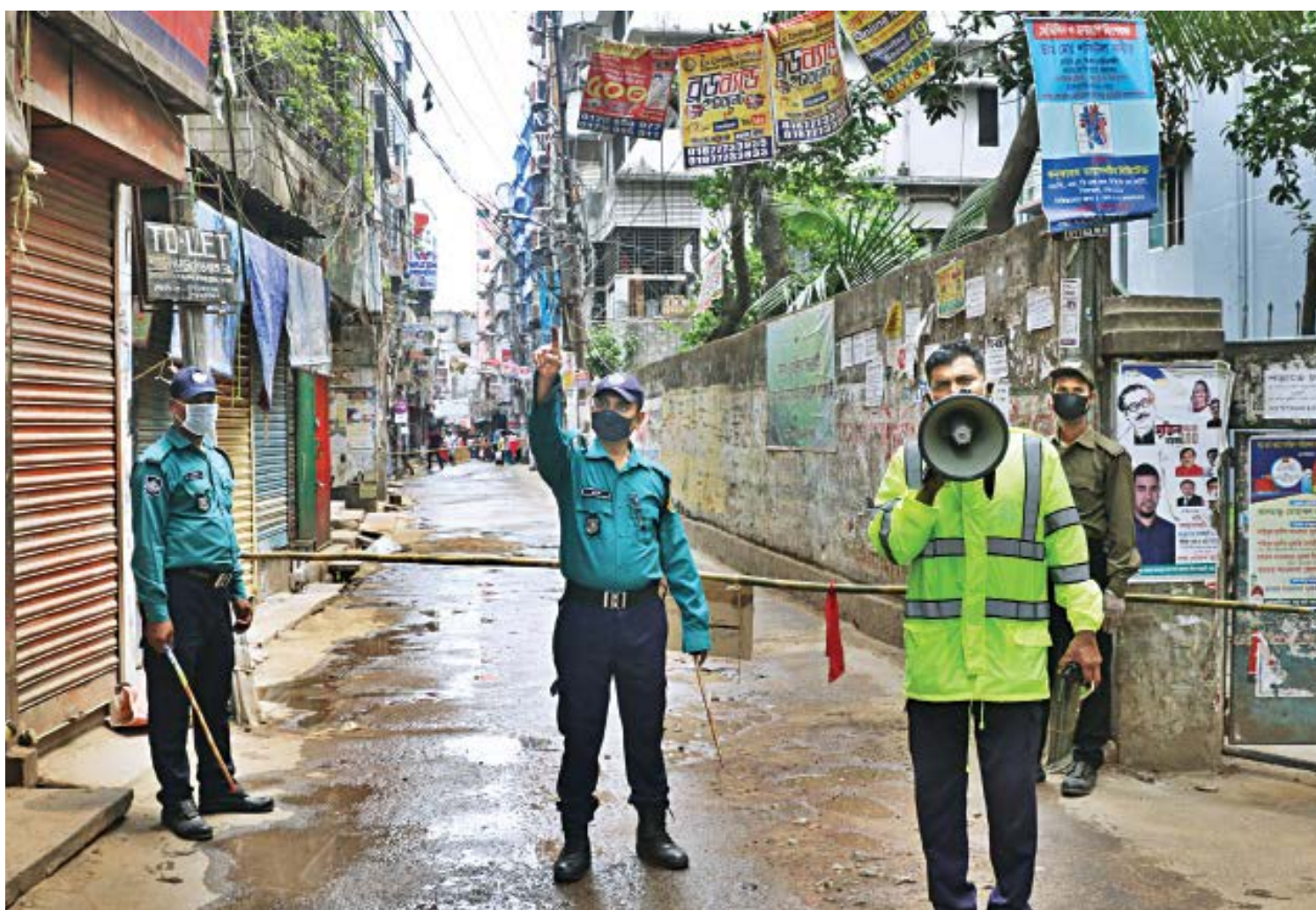
Policemen ask people to stay indoors after placing Nobabganj Road in the capital's Lalbagh area on lockdown yesterday. The measure was taken after a resident of the area tested positive for novel coronavirus.