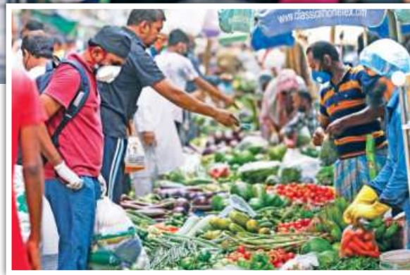
People crowd Dhupkhola Bazar in the capital around 1:00pm yesterday to buy groceries and daily essentials, putting themselves and others at risk of coronavirus. An army team called upon them to maintain social distancing, but to no avail. Inset, people buying vegetables at the bazar.