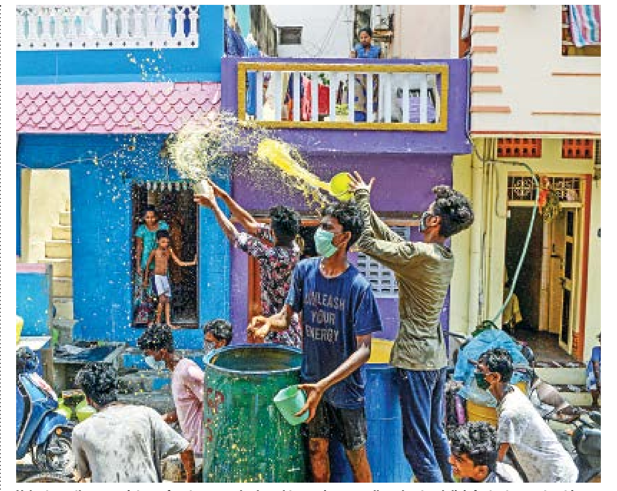
Volunteers throw a mixture of water, neem herb and turmeric as an alleged natural disinfectant on a street in a residential area in Chennai, India yesterday during a government-imposed nationwide lockdown as a preventive measure against the coronavirus.

Meanwhile, Kerala Chief Minister Pinarayi Vijayan has shot off letters to chief ministers of Delhi and Maharashtra to ensure the safety of nurses hailing from Kerala working in these states following reports of para- medical staff being affected with Covid-19. Vijayan had said 46 nurses from Kerala in Mumbai have been infected by the virus and more than 150 nurses were under observation there.