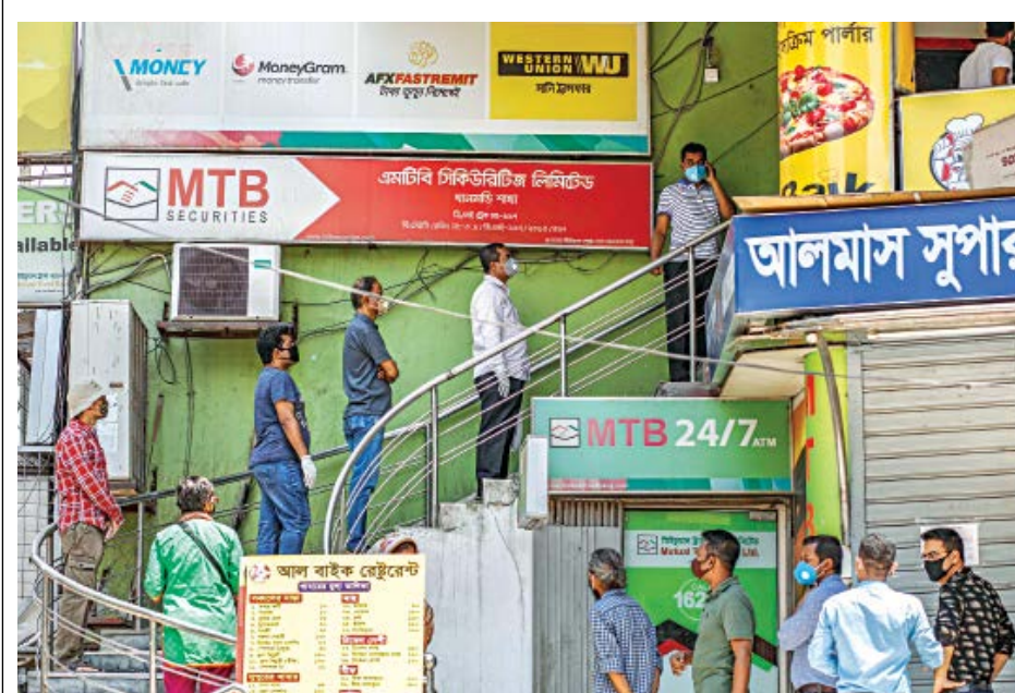
Customers line up to take counter services from a bank branch in the capital's Dhankhondi area yesterday while maintaining a safe social distance.

Asked how the central bank would give support to banks for implementation of the bailout package, its spokesperson Md Serajul Islam said the BB was awaiting instructions from the finance ministry.