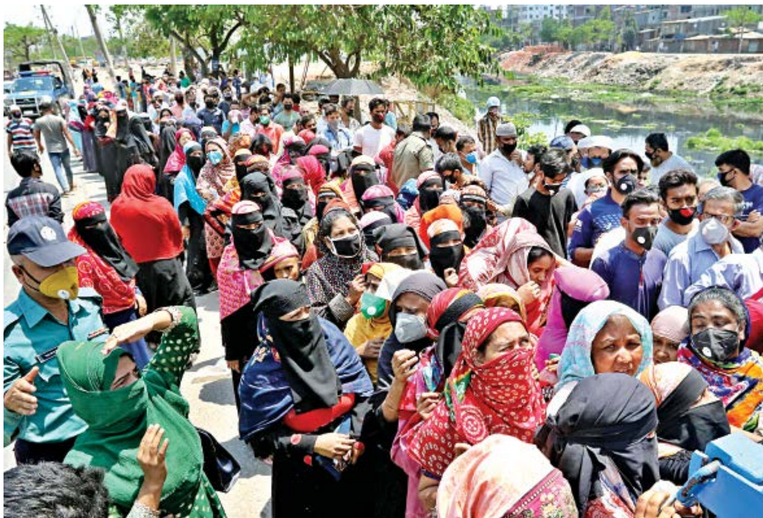
Showing disregard for social distancing, dozens queue up in front of a truck of the state-run Trading Corporation of Bangladesh (TCB) to buy daily essentials at cheaper prices. On-duty policemen requested them to stand apart but it was not heeded. The photo was taken in the capital's Lalbagh Beribandh area around noon yesterday.