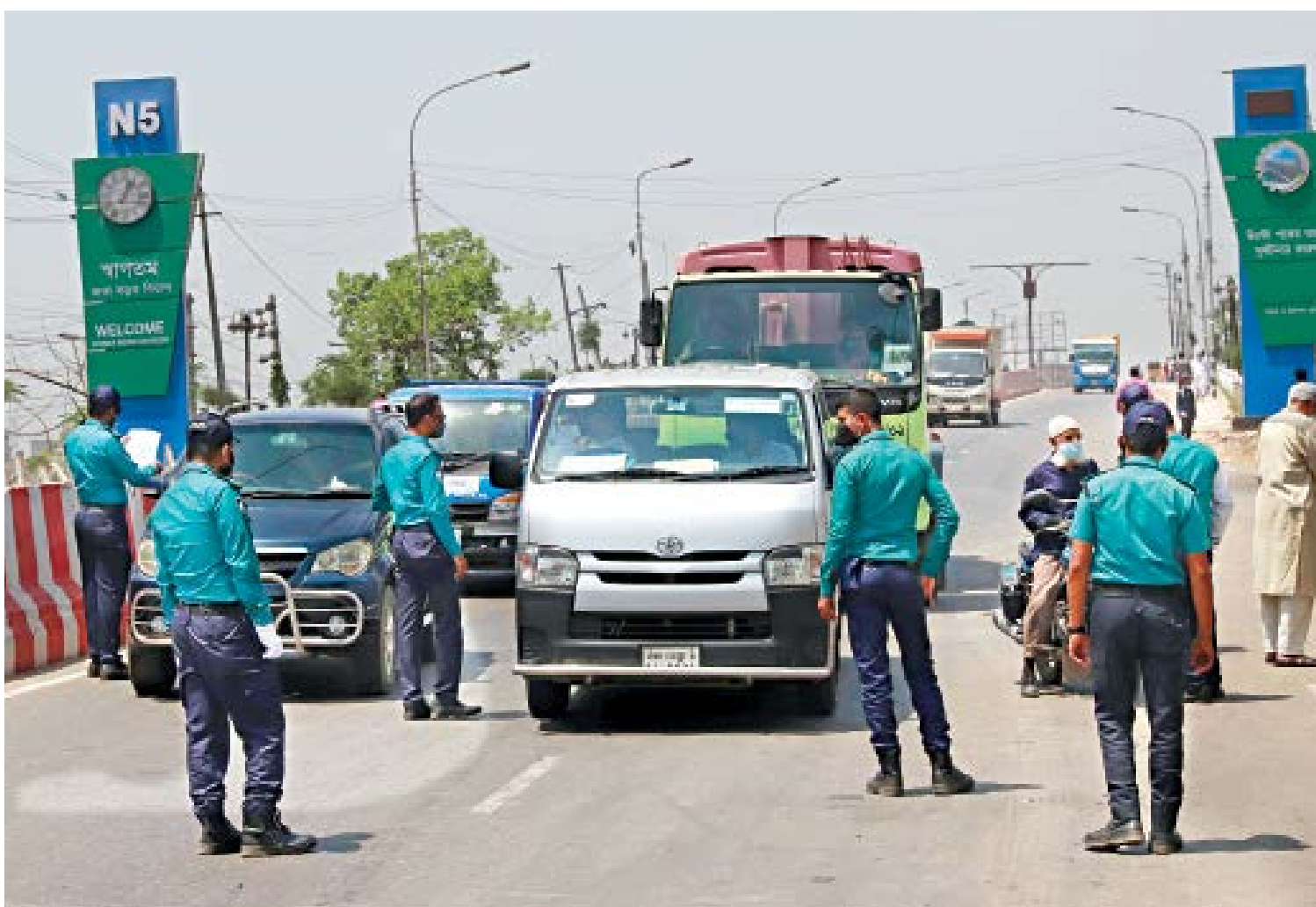
Police stop vehicles at a checkpoint near Gabtoli bridge yesterday, a day after it said people would not be allowed to enter or leave Dhaka city except for emergencies. The move was taken as part of efforts to slow down coronavirus transmission.