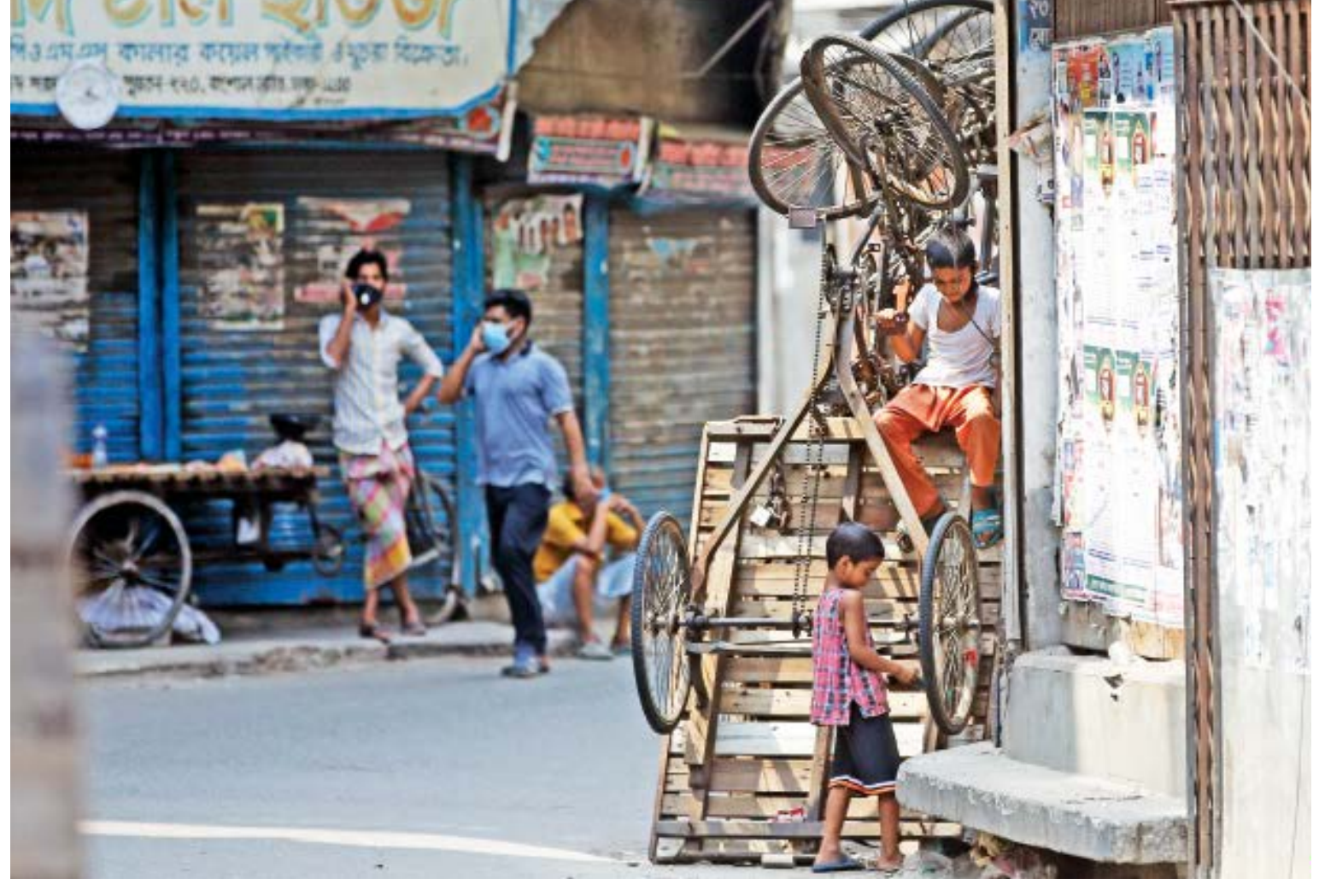
As lockdown continues across the country, even busy Bongshal gets to witness some lazy afternoons. Two children play with rickshaw vans left by the street, while people in protective masks busily pass through. These narrow alleyways were once jam-packed and action-filled at all hours, but it's almost as if the clock has stopped now.