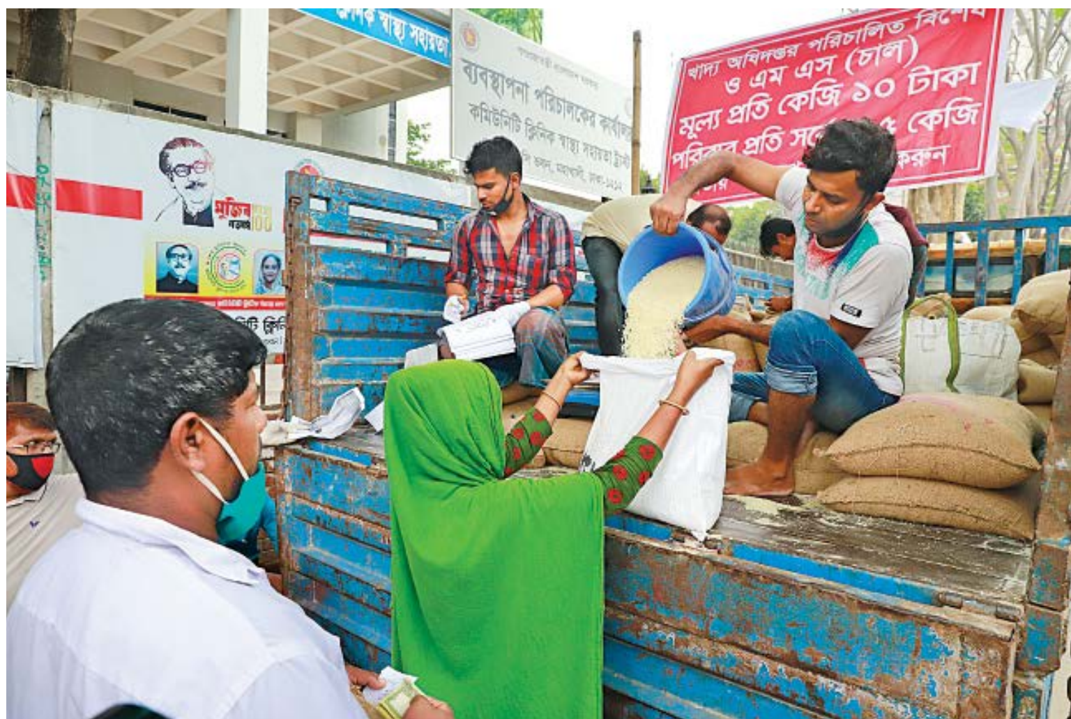
A woman buying rice for Tk 10 a kg under the government's open market sale programme in the capital's Mohakhali yesterday. People in the low-income bracket form queues and often wait for hours to buy essentials at affordable prices.