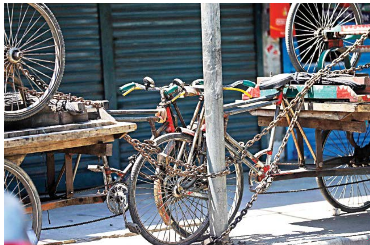
Heavy chains and locks secure rickshaw vans to an electricity pole in the capital's Azimpur amidst demand for the movement of goods reducing to a trickle for a government shutdown aimed at curtailing the spread of the pandemic. The photo was taken recently.

Agrani will also provide 5,000 personal protective equipment to the welfare fund for distribution, he added.