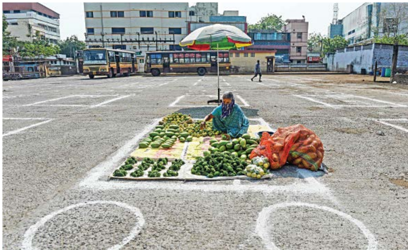
A vegetable vendor sets up her stall on a marked area on the floor maintaining social distancing at a bus stand during a government-imposed nationwide lockdown as a preventive measure against the COVID-19 coronavirus, in Chennai, India, yesterday.