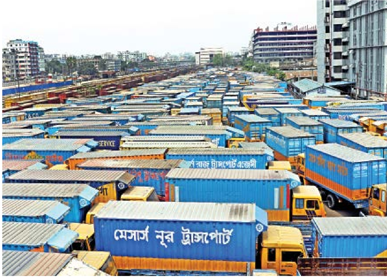
STAGNANT ... Dozens of cargo trucks lie idle tightly packed near Tejgaon Truck Stand, as businesses have screamed to a halt amid the nationwide shutdown to prevent the spread of coronavirus. This photo was taken yesterday noon.