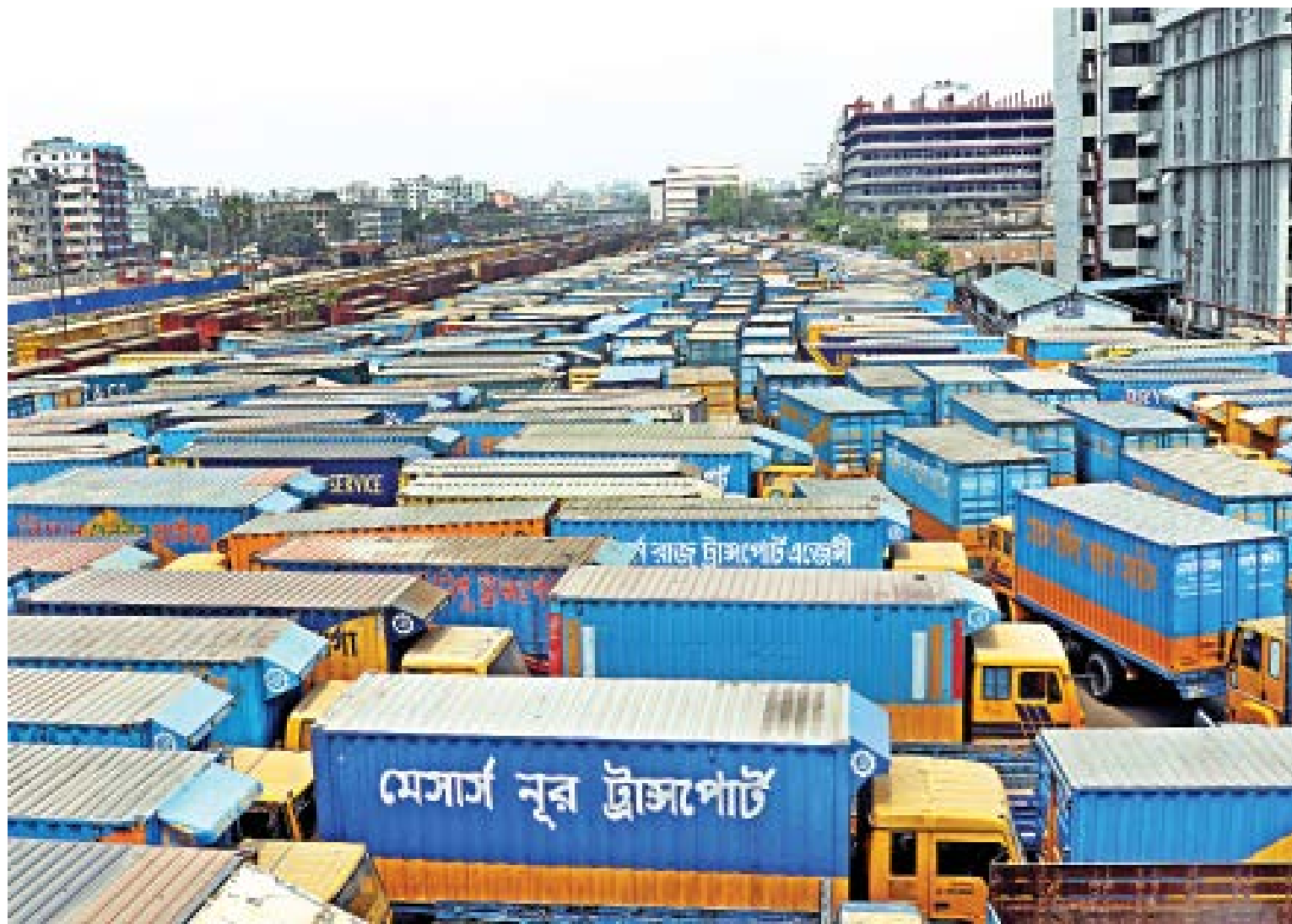
STAGNANT ... Dozens of cargo trucks lie idle tightly packed near Tejgaon Truck Stand, as businesses have screamed to a halt amid the nationwide shutdown to prevent the spread of coronavirus. This photo was taken yesterday noon.