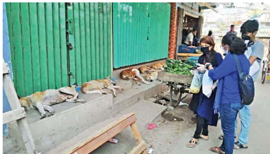
Members of Animal Care of Chattogram showed up with food for the street dogs at Patharghata area recently.