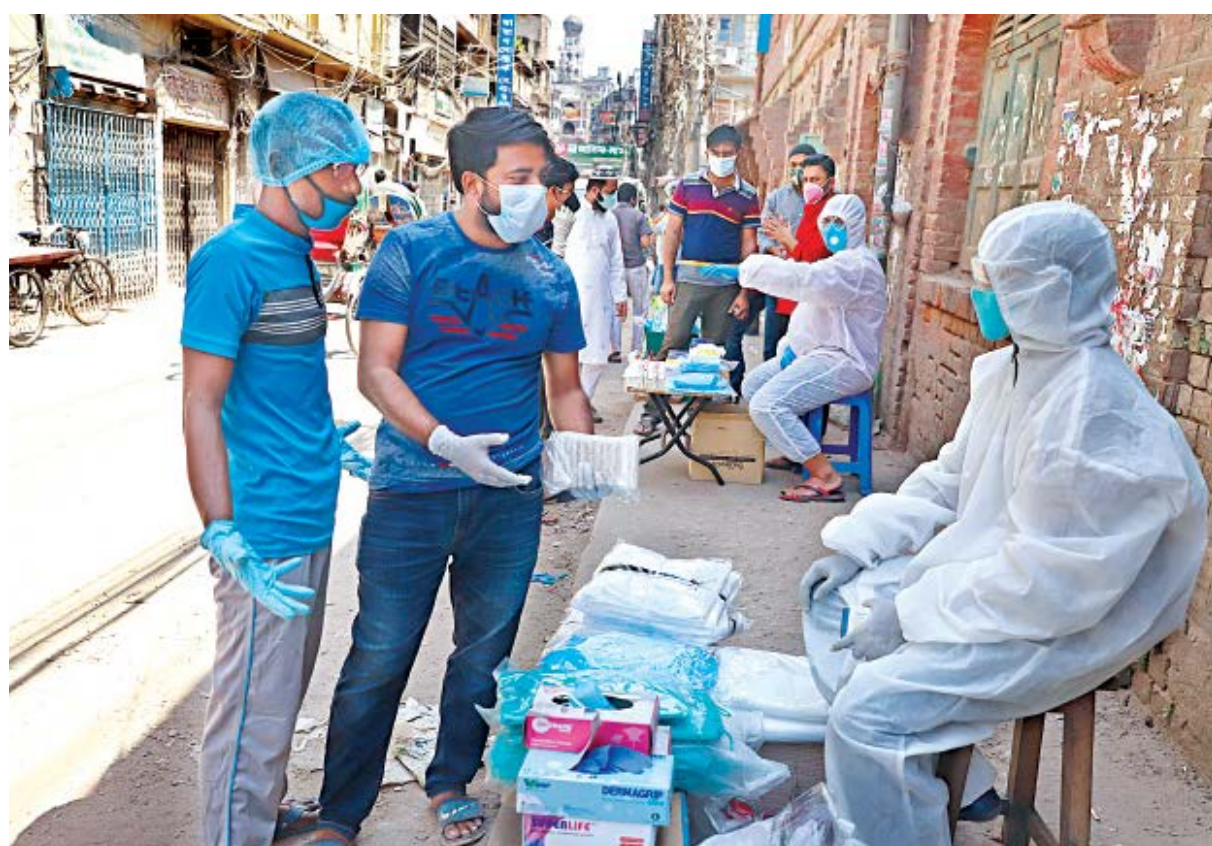
With PPE and hand sanitisers in high demand, many set up shops on the pavement near Midford Hospital and are selling those with a high markup. The photo was taken yesterday.