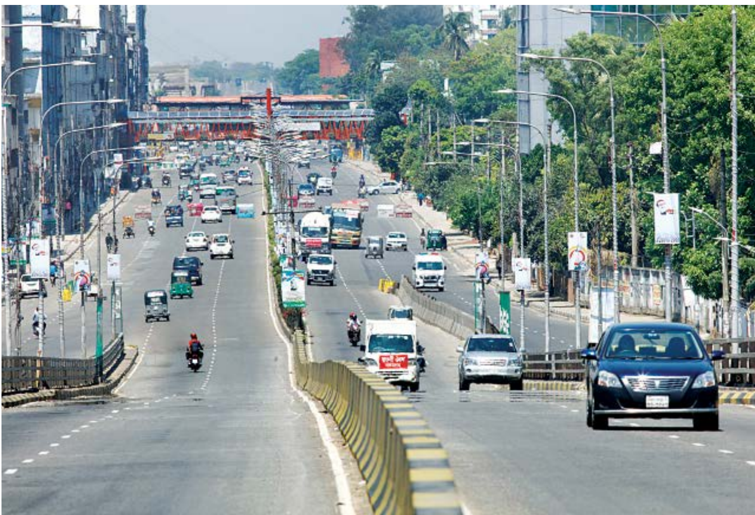
Many city dwellers have started using their vehicles for essential travels in the capital over the last couple of days. The city had gone quiet since the 10-day closure began on March 26. The photo was taken from Mohakhali Flyover.