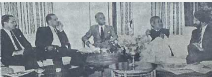
Lt. General Jagjit Singh Aurora calls on Bangabandhu at his official residence on March 25, 1972.