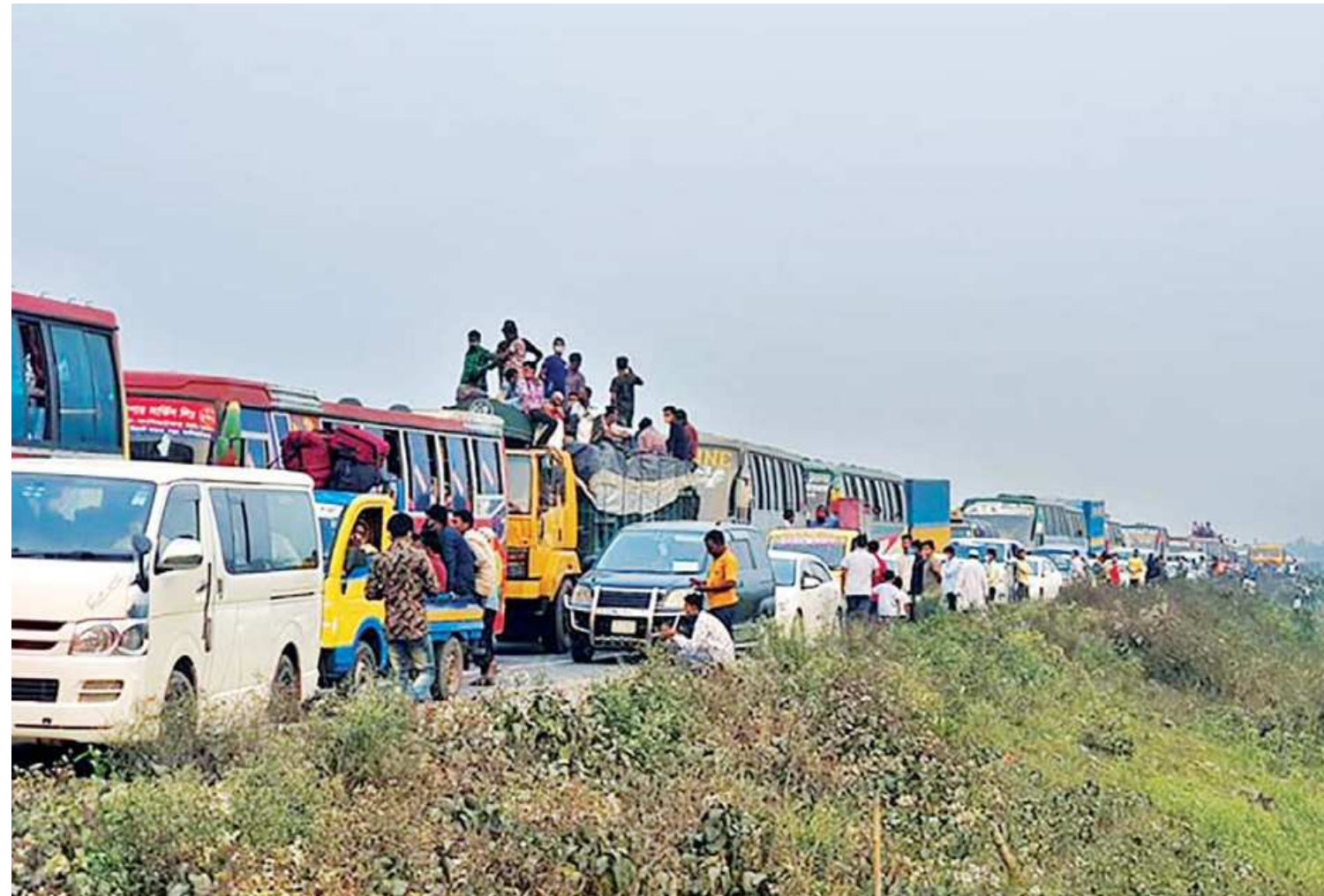
Vehicles stuck in a long tailback on the eastern side of Bangabandhu Bridge in Tangail's Bhuapur upazila yesterday morning. Although the government suspended public transport services from yesterday as part of its efforts to contain the spread of coronavirus, many vehicles continued to ply the highway. The situation was similar on the western side of the bridge in Sirajganj Sadar upazila.