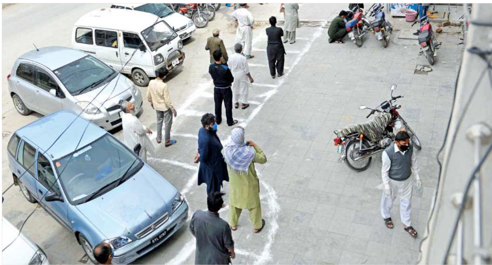
Customers stand on marked floor outside a grocery store to maintain recommended social distancing during a nationwide lockdown as a preventive measure against the Covid-19 coronavirus in Islamabad, Pakistan, yesterday.

It is believed that around 70 per cent out of a total 5.5 crore workforce could get unemployed.