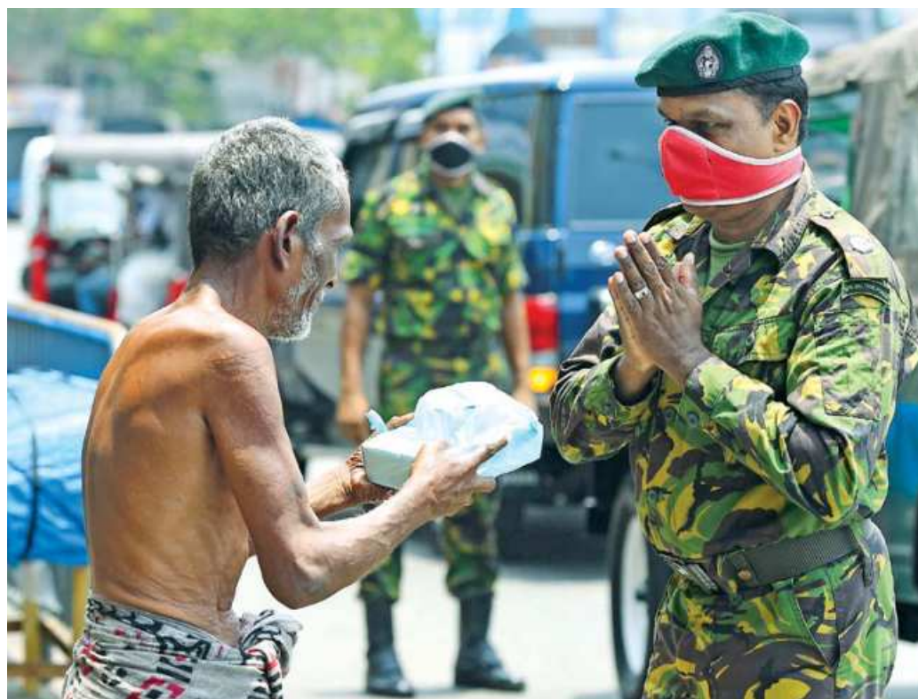
Sri Lanka's Special Task Force police commando officers distribute food to homeless people during a nationwide curfew, in Colombo, yesterday. The country is under a lockdown since March 20 as part of efforts to reduce the spread of the coronavirus which has infected at least 102 people in the island of 21 million people.

He and his brother Mahinda, now serving as prime minister, are adored by the island's Sinhala majority for spearheading the defeat of separatist Tamil militants to end the country's 37-year ethnic war in 2009.