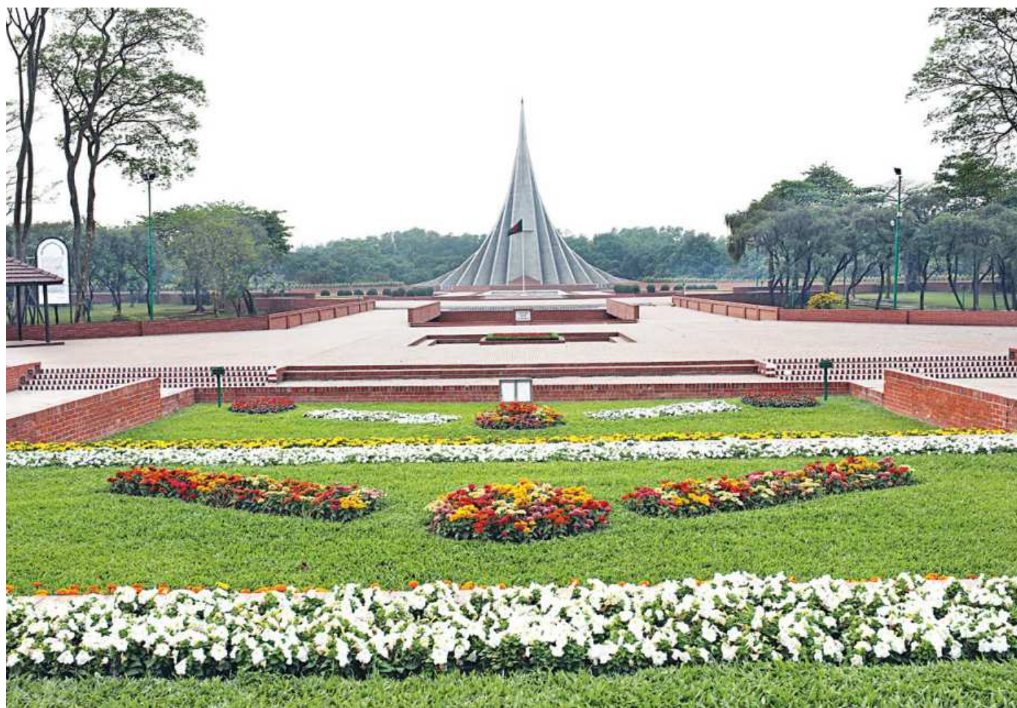
The National Memorial in Savar on the outskirts of the capital was completely empty on Independence Day yesterday. Every year, people visit the memorial in droves to pay homage to Liberation War martyrs, but not a single person was allowed entry yesterday. The authorities took the decision to avoid gathering as part of efforts to contain the spread of coronavirus.