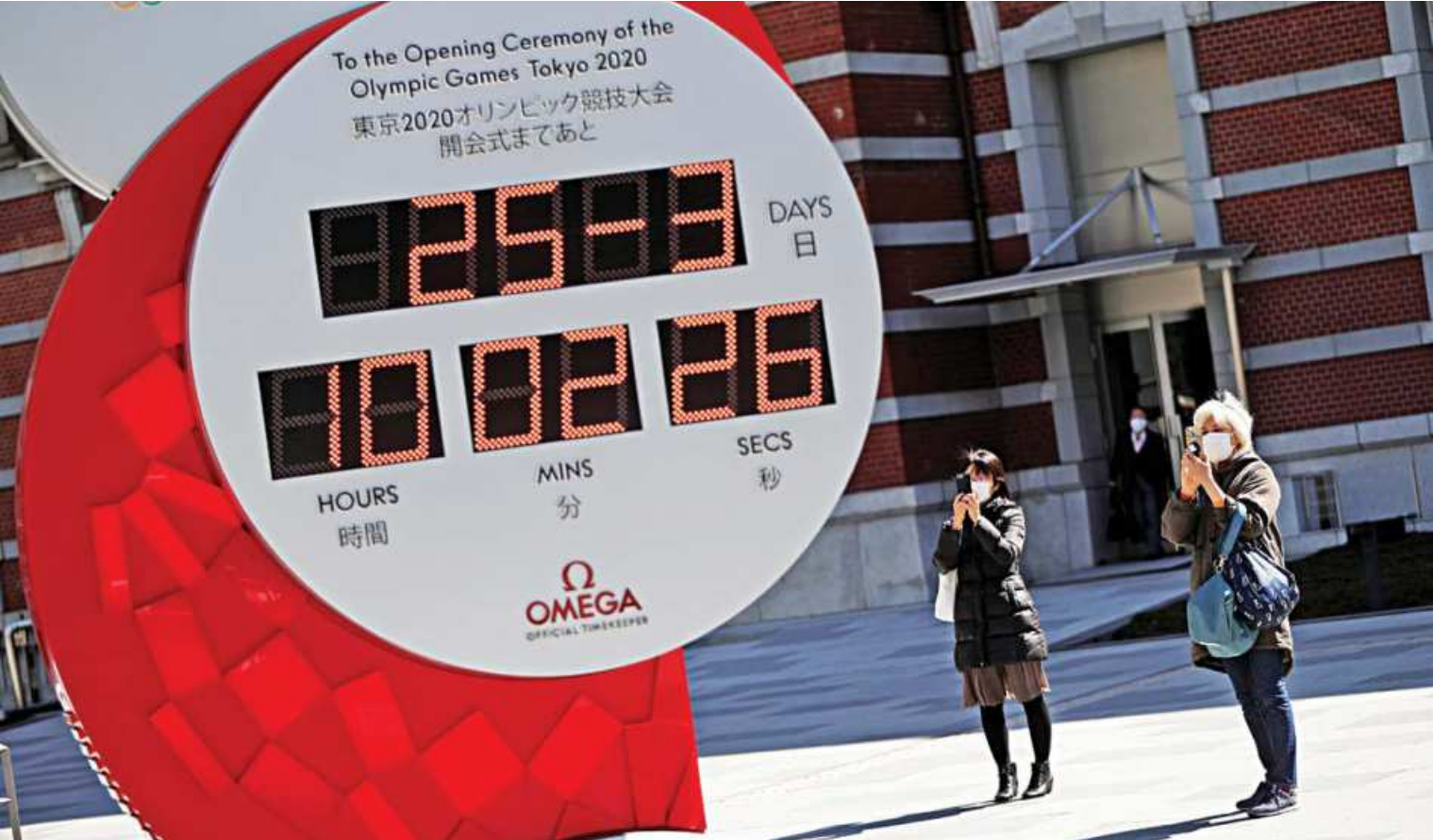
People take pictures of an Omega clock, previously used as a countdown clock for the Tokyo 2020 Olympic Games but currently displaying current time and date, after the announcement of the games’ postponement in Tokyo on Wednesday.