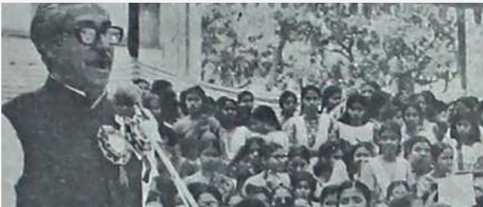
Bangabandhu addressing teachers and students of the capital's different educational institutions at Azimpur Girls' School on Independence Day (March 26, 1972).