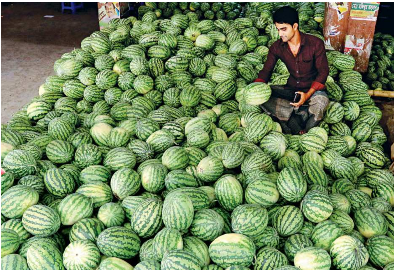
A farmer arranges watermelons at a wholesale shop in the capital's Karwan Bazar yesterday. He was struggling to sell the summer fruit, brought from Patuakhali's Galachipa upazila, due to a lack of customers, as many have already left the capital following the declaration of a 10-day general holiday by the government. The growers were asking Tk 15,000 for each 100 watermelons.

NILIMA JAHAN In the wake of the coronavirus outbreak, a large number of people have opted for ordering groceries online from the safety of their homes. Customers want to avoid the danger of interacting with people and at the same time, stock up on necessities as people fear a drawn-out self-isolation period until the crisis passes. Home deliveries are considered a safe option. Waseem Alim, co-founder and CEO of Chaldal, an online grocery and delivery platform, says they have been serving 4,000 customers a day in Dhaka through their 350 delivery workers. Such platforms have seen a surge in business in the past weeks. Chaldal has been inundated with orders and has been operating at maximum capacity. Due to this, customers now need to wait for almost a week for their next available slot for delivery. Sabrina Fatema, a resident of Dhanmondi, said she was trying to order a disinfectant item on the site on March 21. The first available slot she found was March 28. Farhana Lubaba, a resident of the Kazipara area of Mirpur, said she had to wait four days to get her order from Shwapno. "I was expecting that I wouldn't be getting my order anymore. I was surprised to get a phone call from a delivery worker on the fourth day," she said. Since more and more people are ordering groceries and SEE PAGE 10 COL 2