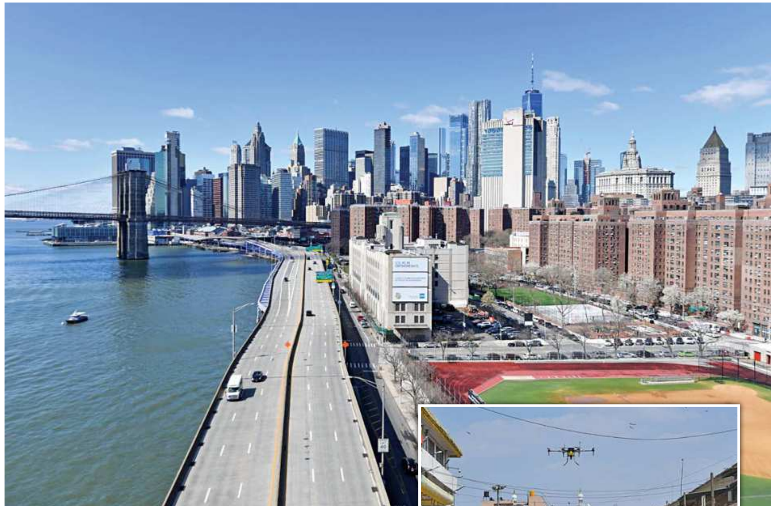
A view of morning traffic on FDR Drive in New York City. Inset, A drone loaded with disinfectant sprays at the deserted road in Bangalore. Global giant India yesterday joined the countries ordering their citizens to stay at home, putting a third of the world on lockdown. Photos were taken yesterday.