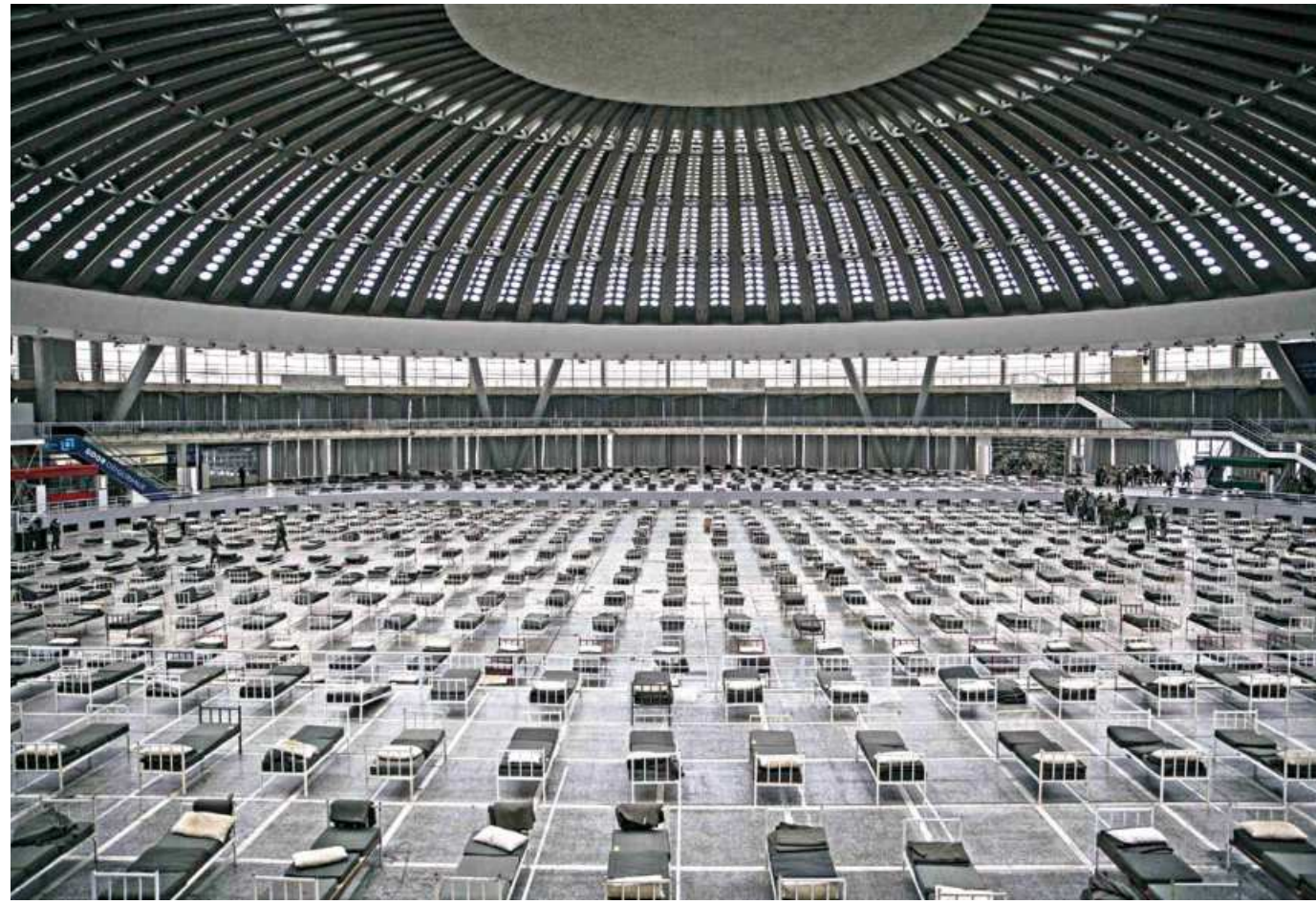
A general view shows Serbian military personal setting up beds inside a hall at the Belgrade Fair to accommodate people suffering from mild symptoms of the coronavirus disease, yesterday.

In their statement, the finance and central bank heads called on all countries to take "liquidity support and fiscal expansion" measures, and said they would coordinate weekly on their own moves.