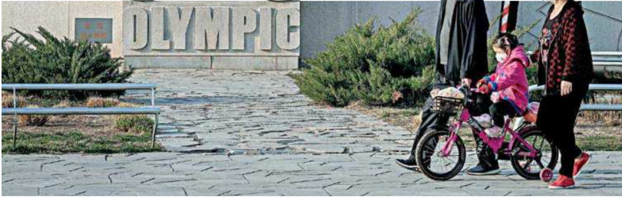
A family wearing face masks, amid concerns of the Covid-19 outbreak, walks before an Olympic rings sculpture at the national 'Birds Nest' stadium, the main site of the 2008 Beijing Olympics in Beijing on Monday. Following boycotts by Canada and Australia, the fate of his year's Summer Games, scheduled to be held in Tokyo in July, hangs in the balance.