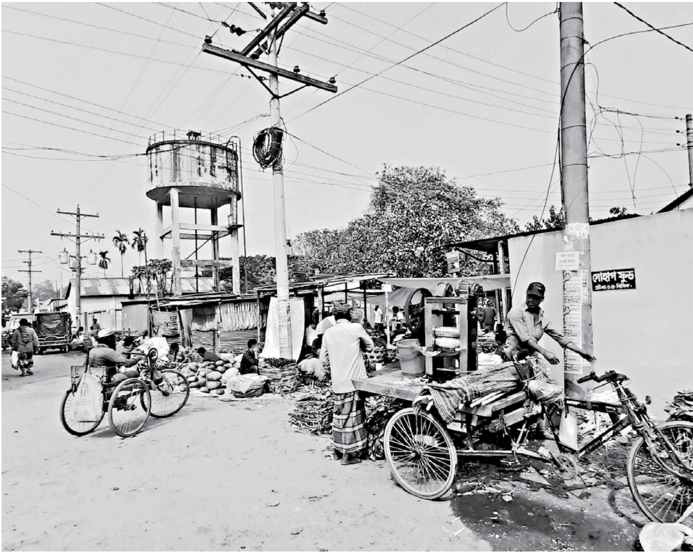
An unapproved kitchen market, occupying two plots of BSCIC industrial area in Tangail, remains a nuisance for the operators of industrial units.