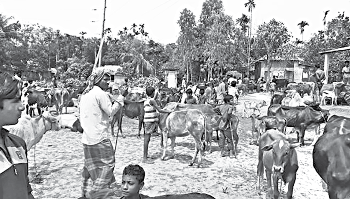
A total of 700 cattle, infected with lumpy skin disease, in Sunamganj's Derai and Shalla upazilas were vaccinated recently. Members of District Livestock Office in Sunamganj conducted the vaccination programme at Ujangaon Government Primary School premises in Shalla upazila on Friday.

50 cows infected by the disease have died in Derai and Shalla upazilas in the last couple of weeks