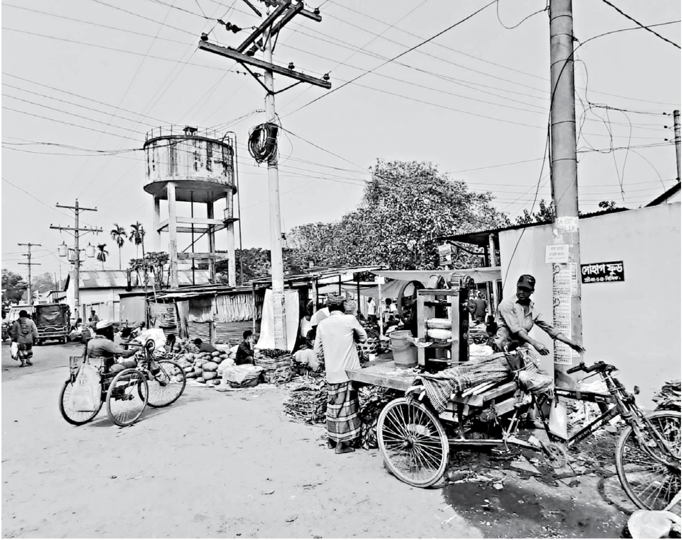
An unapproved kitchen market, occupying two plots of BSCIC industrial area in Tangail, remains a nuisance for the operators of industrial units.