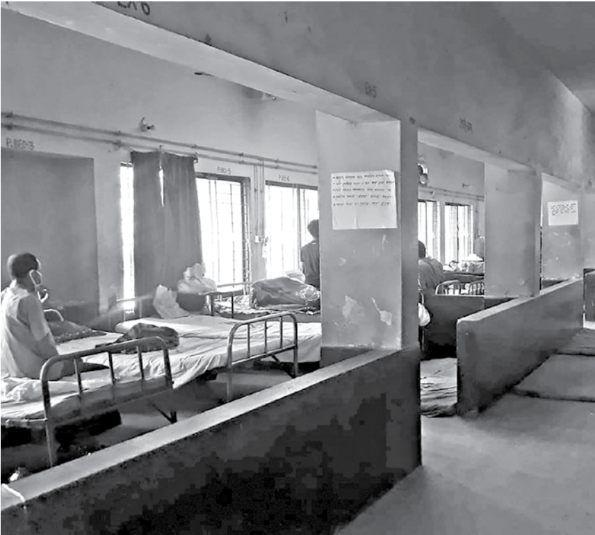
A ward of Tangail General Hospital, which usually sees a huge crowd of patients, is seen almost empty due to epidemic of coronavirus. The photo was taken yesterday.

He also said many cows have been infected by the disease. Vaccines have been given to 700 cows till now.