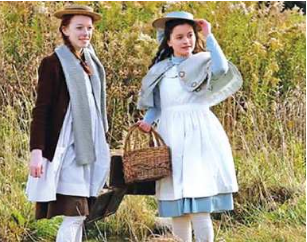
Anne with an E

Moreover, One Day at a Time is a throwback family sitcom filled with brilliant comedic performances. This clever remake of Norman Lear’s ‘70s hit about a single mother raising two teenage daughters finds familiar laughs in the way generations clash and families wage war, but it’s also socially engaged and leisurely paced in a way that makes it stand out. Lastly, Netflix’s Virgin River is comforting and a welcome respite. The story follows the protagonist, Mel, navigating the ins and outs of a town where everyone knows each other, and dealing with the old-fashioned views of Doc Mullins, both when it comes to medicine and gender roles. These shows offer humour, heart and in some cases, just relaxation. Hopefully in these troubling days, they can provide you with some relief for a few hours.