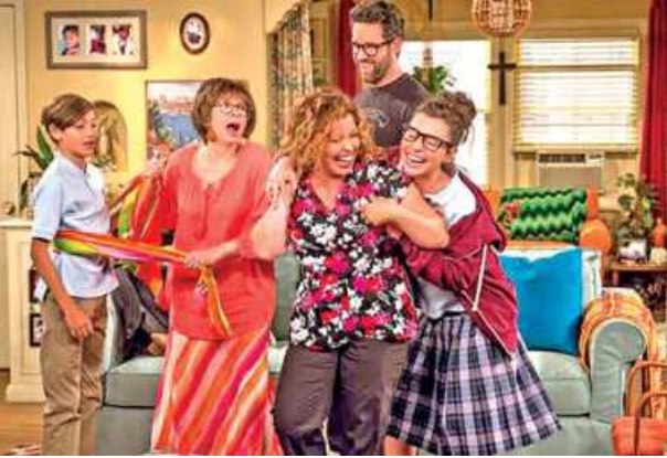
One Day at a Time

With the rapidly spreading coronavirus forcing people to practice social distancing and in some cases, self-quarantine, we are all likely to have some leisure time on our hands as we stay at home in hopes of slowing the illness’s spread. One of the best ways to pass the time now is to stream some good television shows. While Netflix’s library is home to popular, contemporary comedies like The Big Bang Theory , Brooklyn Nine-Nine , The Good Place as well as classics like Friends , That 70s Show and Gilmore Girls that wrap us up in a nostalgia cocoon, there are several lesser-known feel-good shows that many may have missed out on. The sitcom, Schitt’s Creek , has amassed a devoted following since it premiered in 2015. In the riches-to-rags story, the Rose family has to move to a tiny town