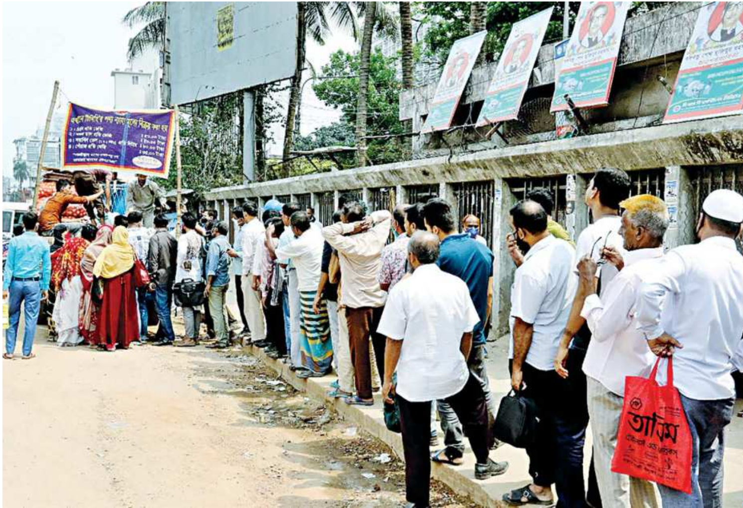
A packed line formed in front of Jatiya Press Club yesterday, as Trading Corporation of Bangladesh sold daily essentials at affordable prices. Even in the time of a viral outbreak, many do not have the luxury to stay home without worrying about finances.

State Minister for Cultural Affairs KM Khalid expressed deep shock at the demise of the noted writer, and conveyed profound sympathy to the bereaved family.