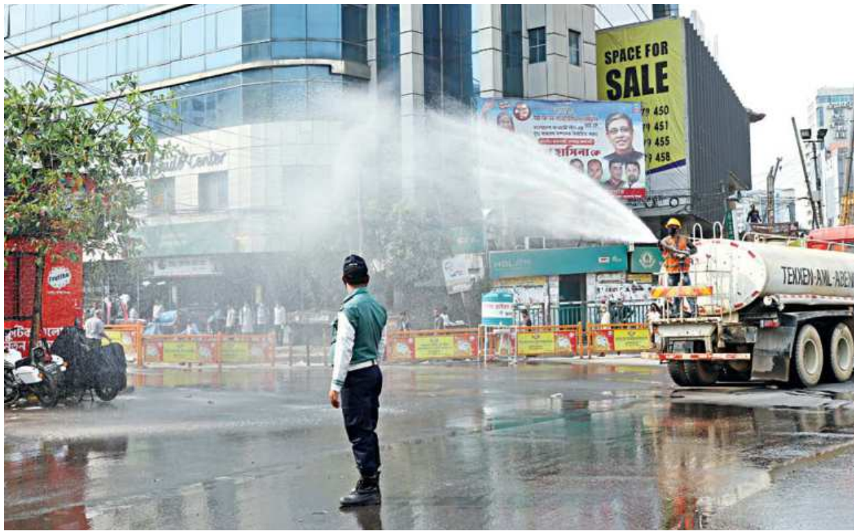
A water bowser of Dhaka North City Corporation sprays antiseptic-mixed water at the Sonargaon intersection of Kazi Nazrul Islam Avenue yesterday.