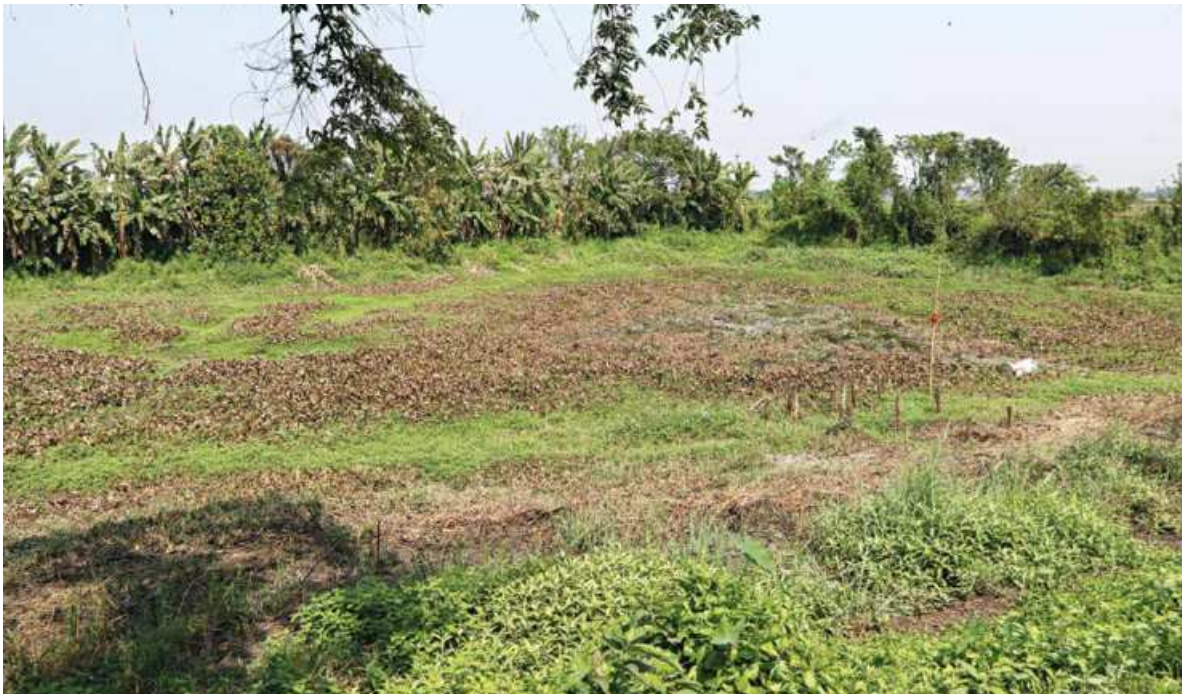
What used to be a pond full of water several years ago is now a mere depression in Savar's Bhakurta. Since January last year, residents of the area have been experiencing severe water crisis. The photo was taken recently.