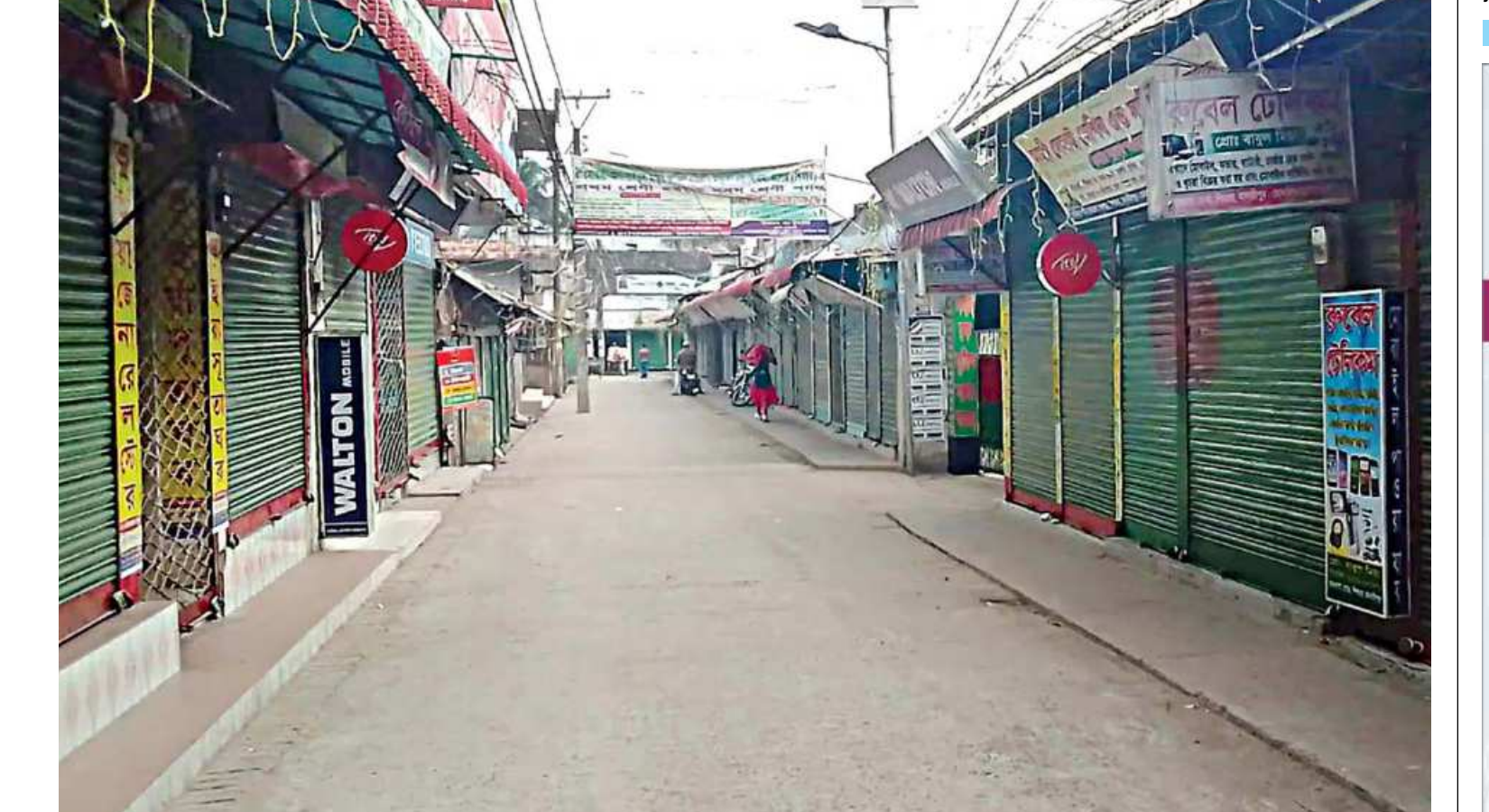
All shops at Shibchar Bazar of Madaripur were closed yesterday after the district administration ordered their closure over coronavirus. It also restricted the movement of people in some areas of Shibchar upazila.

More Information, please visit www.icddrb.org/Mujib100RGfW or e-mail Mujib100RGFW@icddrb.org