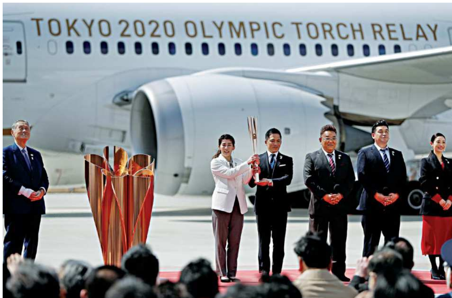
Despite growing concern over coronavirus, Japan and the International Olympic Committee are adamant to host the Summer Games in Tokyo in July, 2020. Here, three-time Olympic gold medalists Tadahiro Nomura and Saori Yoshida pose for photos after lighting the Olympic Flame at Japan Air Self-Defence Force Matsushima Base in Miyagi prefecture on Friday.