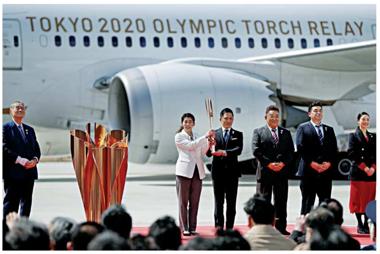
Despite growing concern over coronavirus, Japan and the International Olympic Committee are adamant to host the Summer Games in Tokyo in July, 2020. Here, three-time Olympic gold medallists Tadahiro Nomura and Saori Yoshida pose for photos after lighting the Olympic Flame at Japan Air Self-Defence Force Matsushima Base in Miyagi prefecture on Friday.