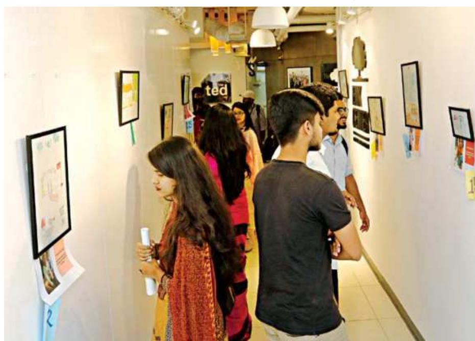
Numerous exhibitions, events and festivals around the city have been postponed over public health concerns.