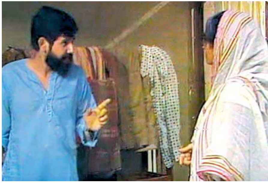
Ei Shob Din Ratri