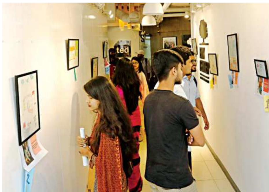
Numerous exhibitions, events and festivals around the city have been postponed over public health concerns.